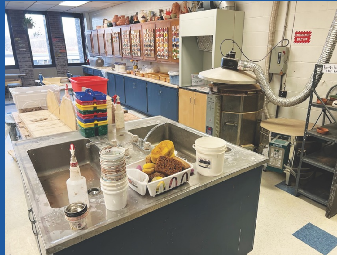
Art classroom at High School