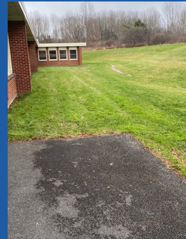
Sidewalk extension at Deerfield