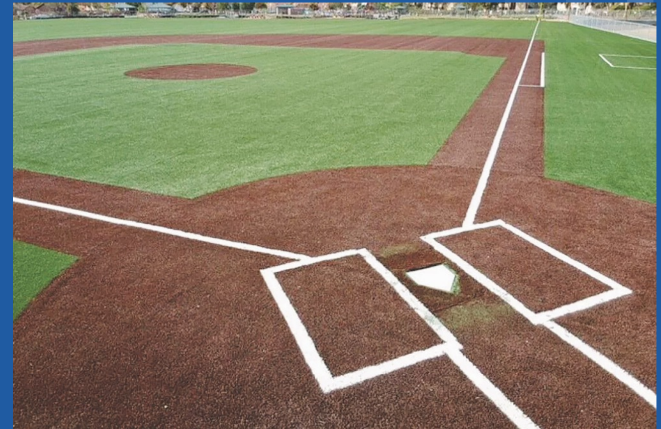
Rendering of a turf field