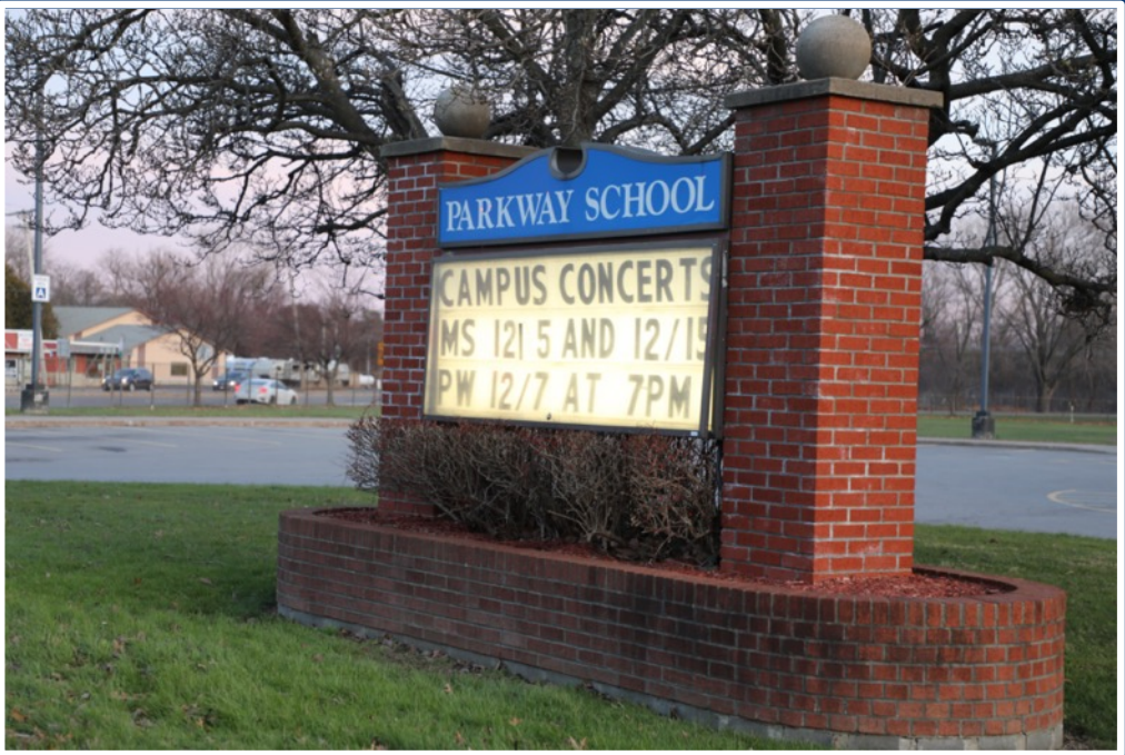
Current marquee at Parkway School