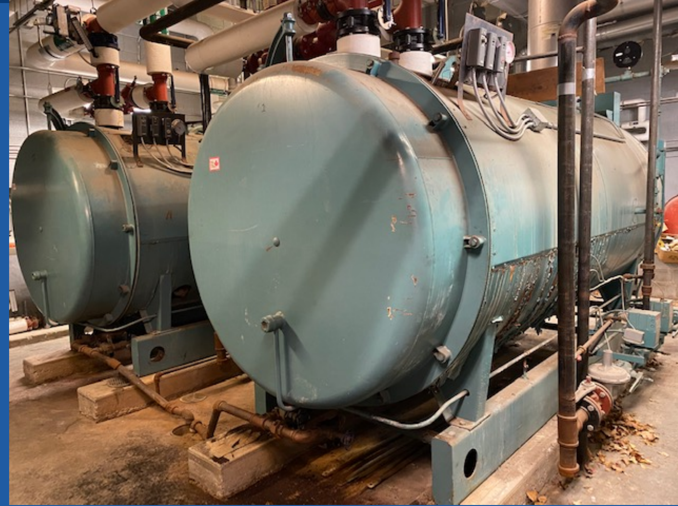
Boilers at Parkway