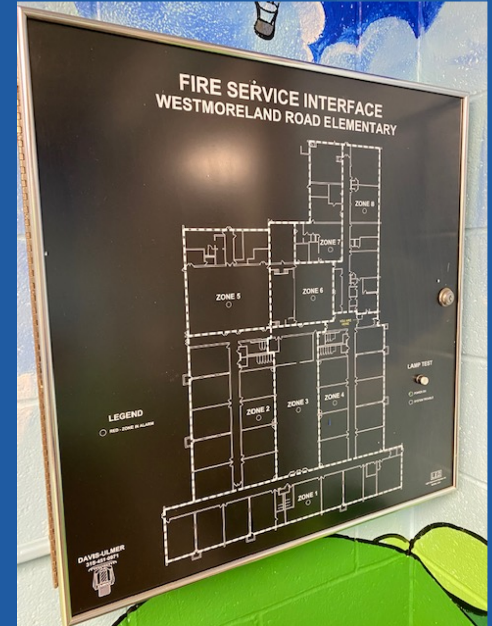
Fire panel at Westmoreland Road