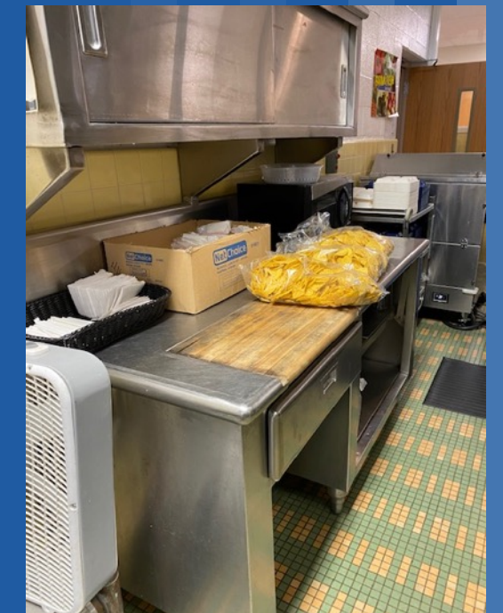
Kitchen at Hart's Hill