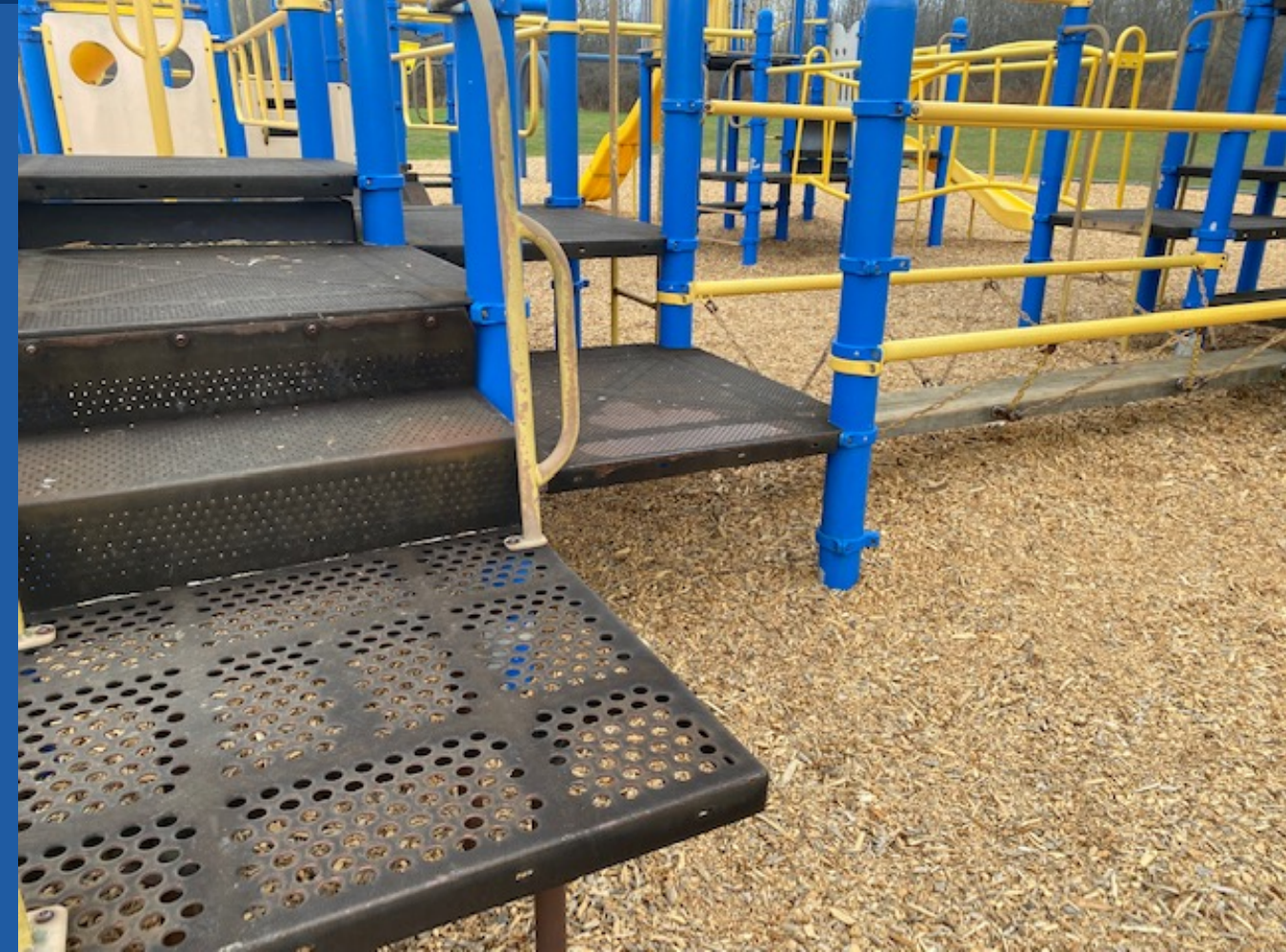
Playground equipment at Deerfield