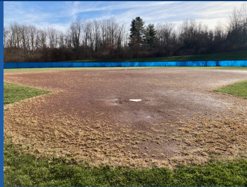
Softball field at Westmoreland Road