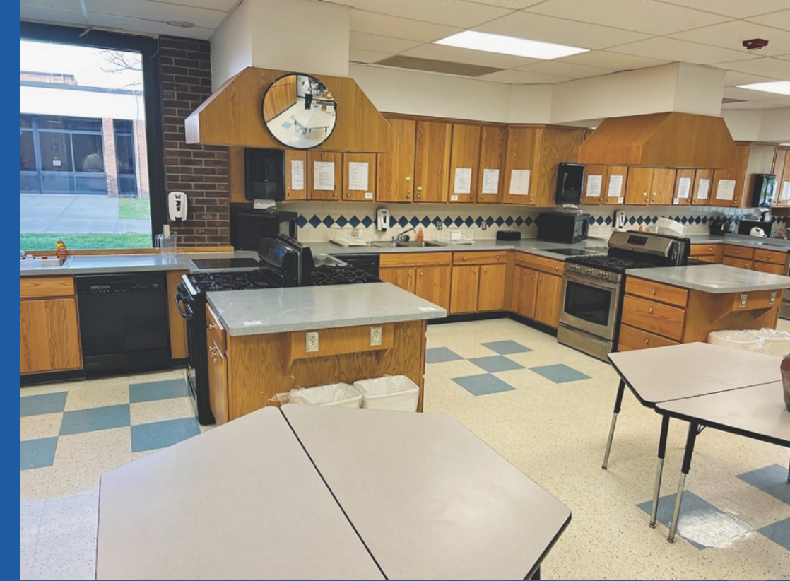
Family & Consumer Science classroom at High School