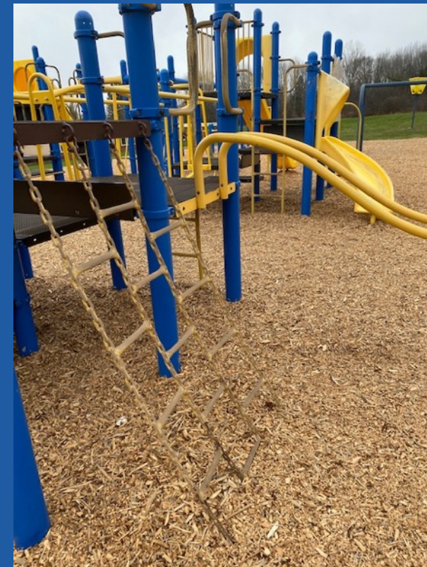
Playground equipment at Deerfield