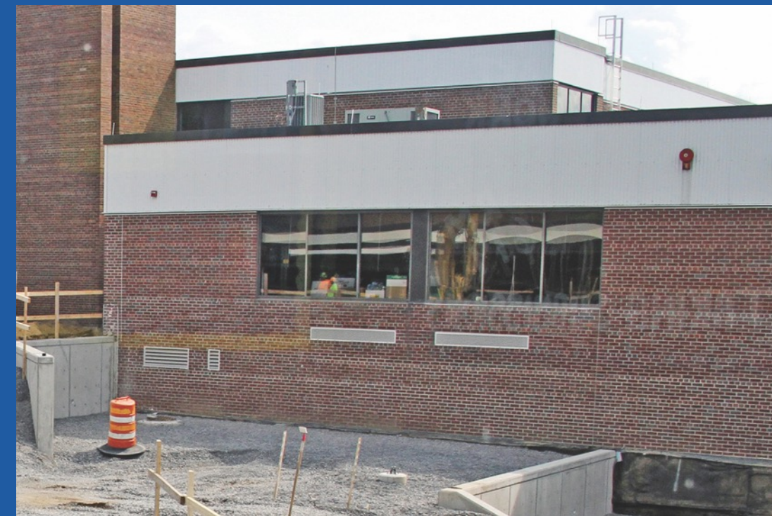
Windows at High School