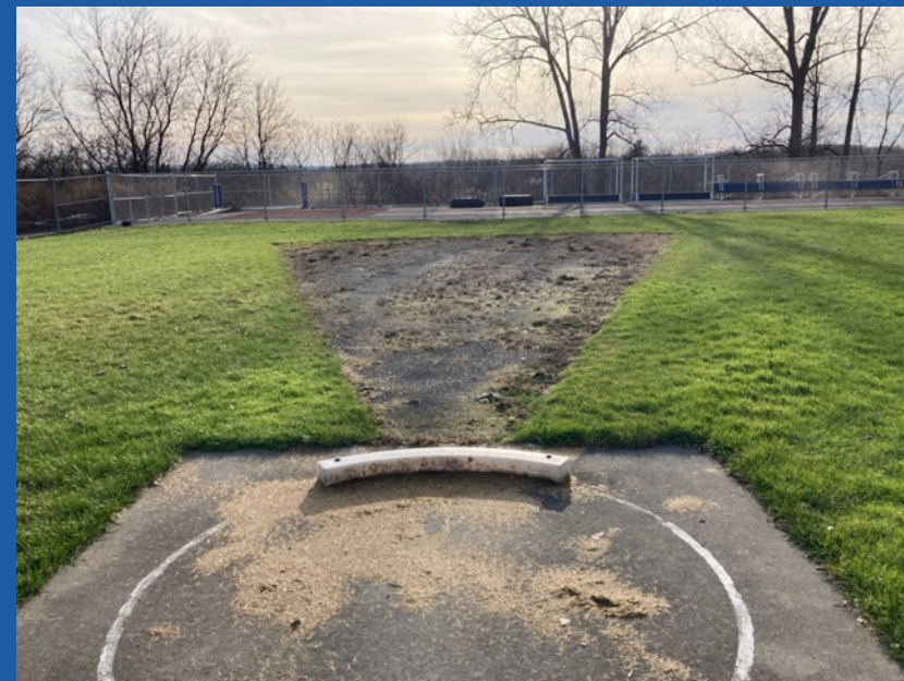
Current shot put at High School