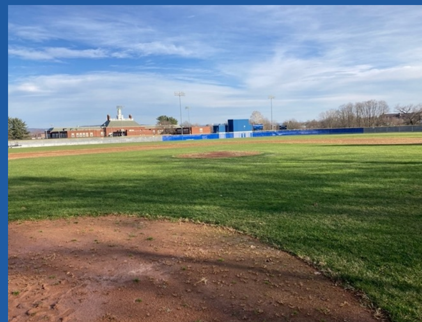
Baseball field at Middle School