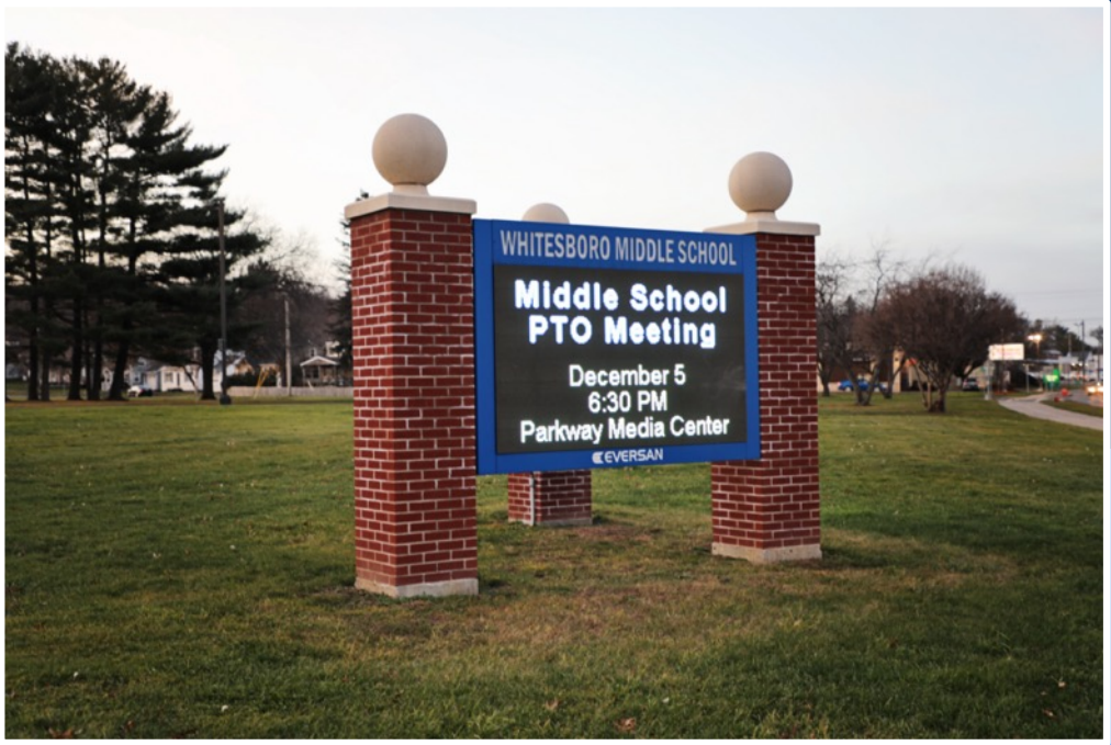
Example of digital marquee (located at Middle School)