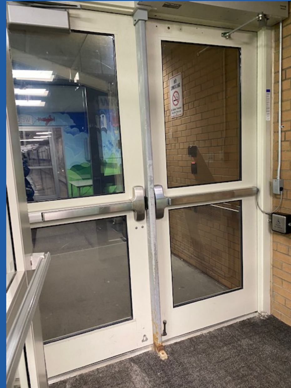
Main vestibule doors at Westmoreland Road