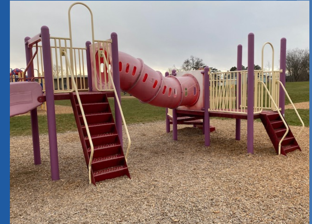
Playground equipment at Marcy