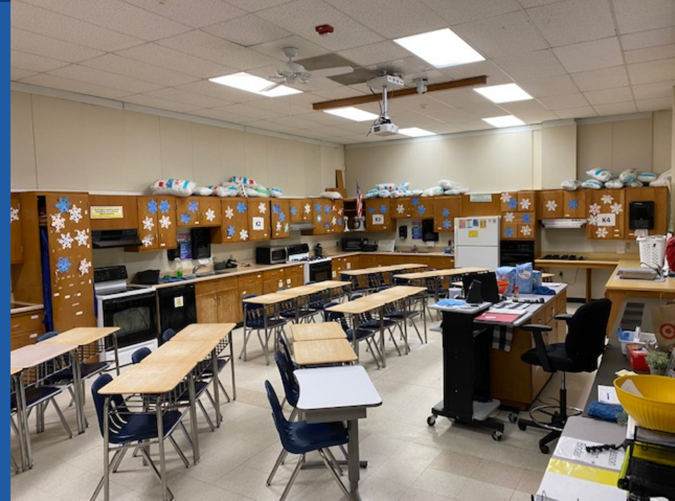
Family & Consumer Science classrooms at Middle School