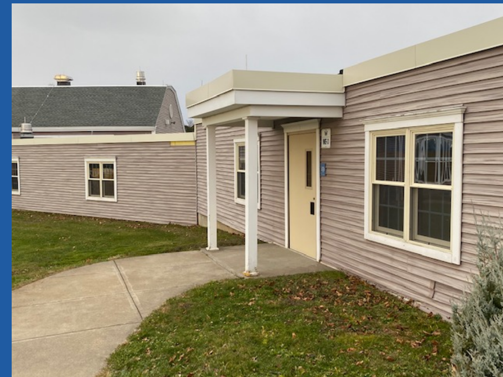
Siding at Marcy