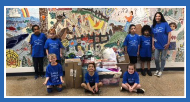
Students and staff at Westmoreland Rd. Elementary collected items to help the animals at Anita's Stevens Swan Humane Society. Thank you to all that donated!