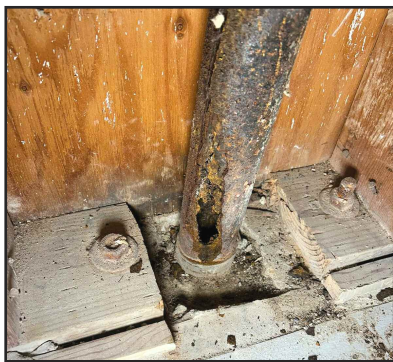
Casita Center - Leaky Pipes