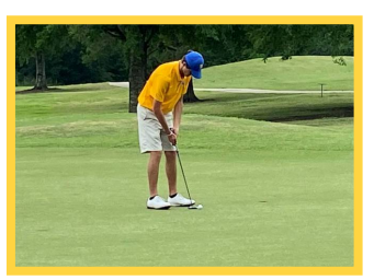
June 24-28: Golf