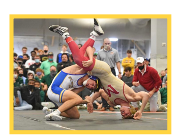
July 15–19 – Wrestling