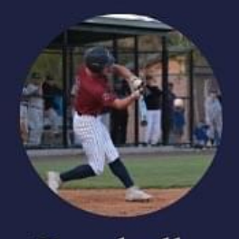
Baseball 5/28 - 5/31