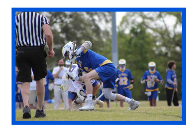
July 15–19 – Lacrosse

•All camps are staffed by the coaches and athletes that make up some of the top athletic programs in Louisiana!