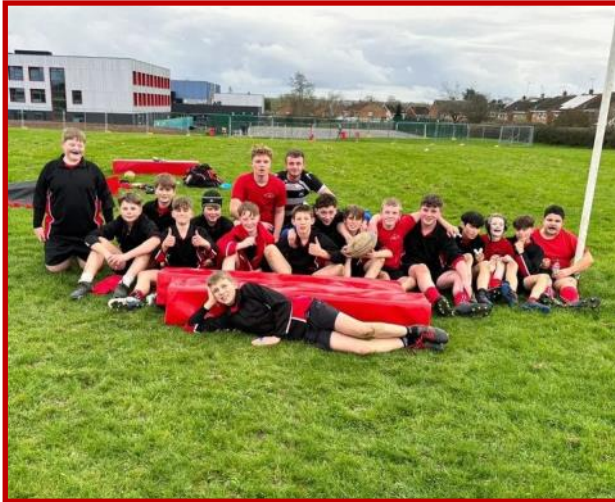
Congratulations to our Year 7/8 boys Rugby team who played against Shipston on Tuesday 19th March and won 4-1.