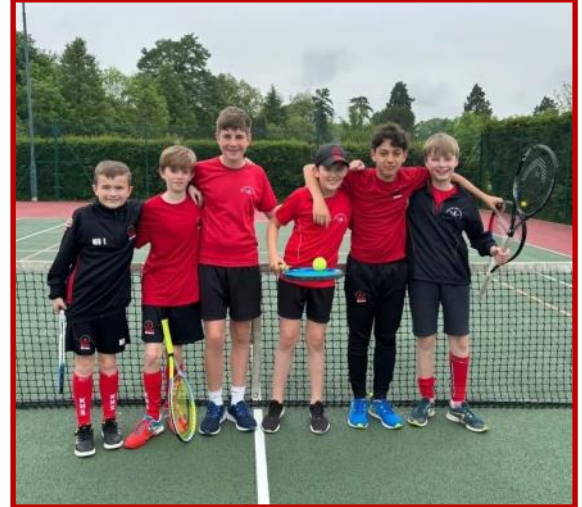
On Thursday 16th May, students in Year 7 and 8 took part in an all day Tennis tournament and came 2nd overall—well done all!