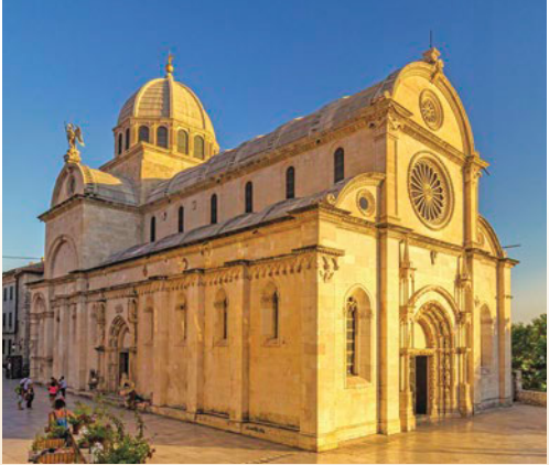
Cathedral of St. James, Šibenik

Šibenik. Šibenik is a proud city that welcomes visitors with lovely alleys, squares and striking