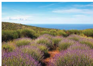
Lavender farm, Hvar