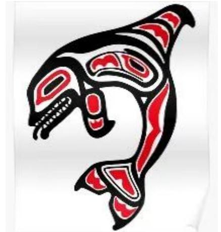
Understanding Coast Salish Design

Land Acknowledgement Resources: https://usdac.us/nativeland https://native-land.ca/