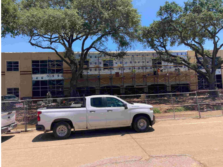
Cast stone arches and brick veneer – Front Entry