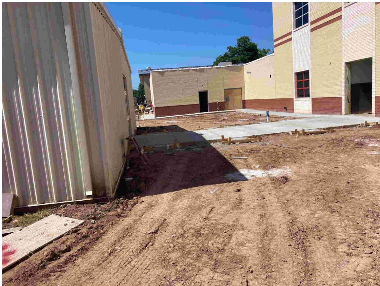
Concrete sidewalks at Section #2 and #7