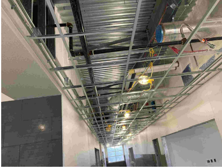
Ceiling grid at 2 nd floor corridor