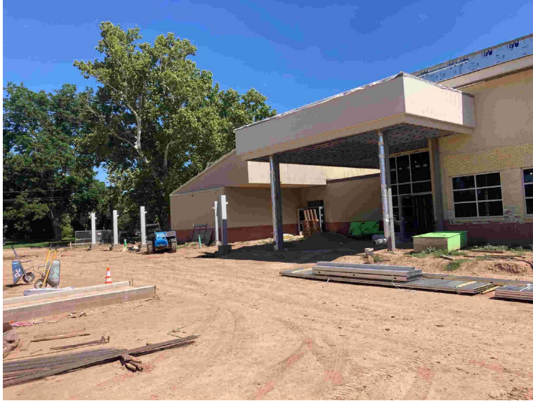
Fascia panels at west entry