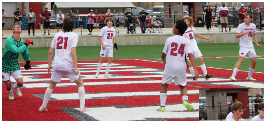
Left: Another example of the effectiveness of Munford's bunched defense in the box: Crockett shooters had to try to put a little loft on the ball at times, in order to get over the Cougar wall.