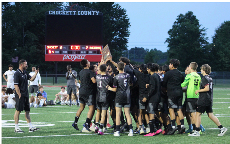
Left: Crockett County's 2024 Cavaliers: District 13-AA and Region 7-AA Champions. Left: Crockett County's 2024 Cavaliers: 16-2 overall record, District 13-AA and Region 7-AA Champions, 16-2 overall record.