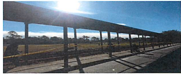
Whittemore Park Middle