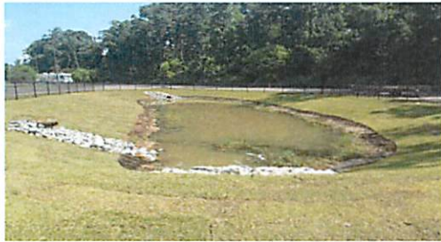
North Myrtle Beach Elementary