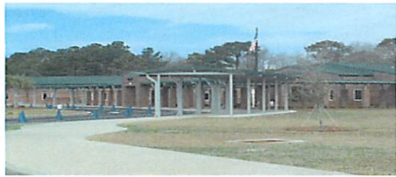
Ocean Bay Elementary