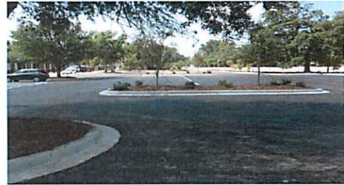
South Conway Elementary