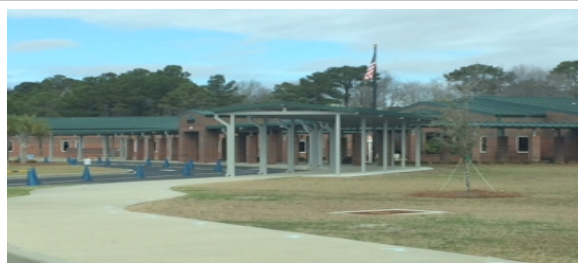
Ocean Bay Elementary