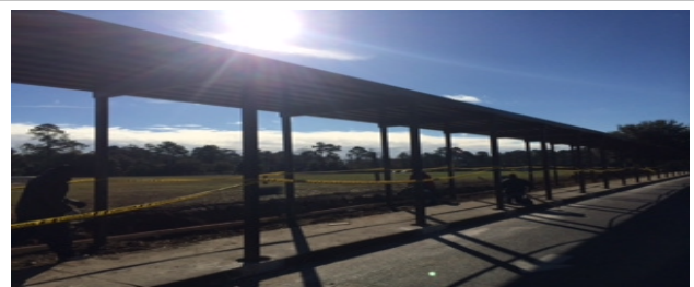
Whittemore Park Middle