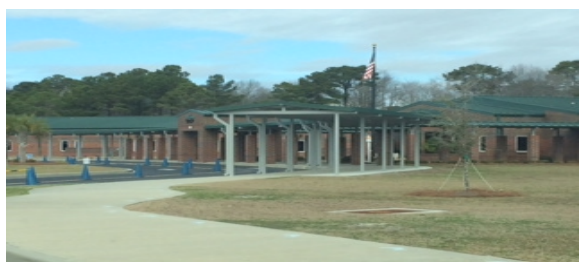
Ocean Bay Elementary