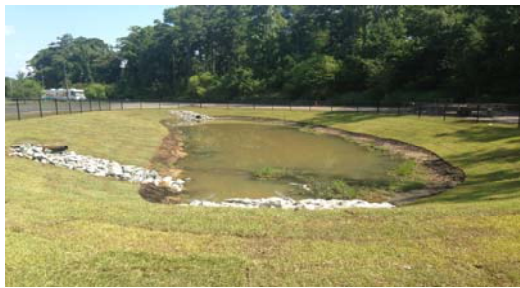
North Myrtle Beach Elementary