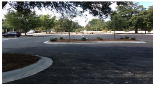
South Conway Elementary