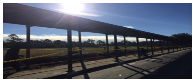
Whittemore Park Middle