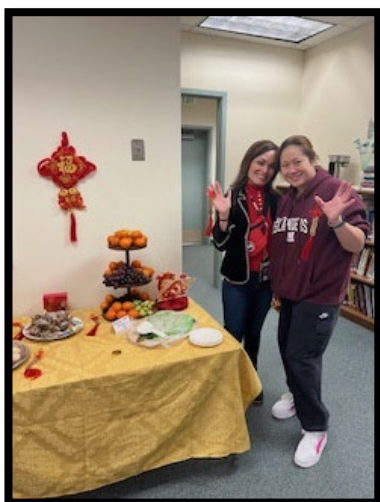
Lunar New Year Celebration with Staff and Students

Diversity, equity, and inclusiveness are embodied across various innovative programs initiated by our elementary schools, ensuring that every student, regardless of their background or abilities, feels a profound sense of belonging and engagement.