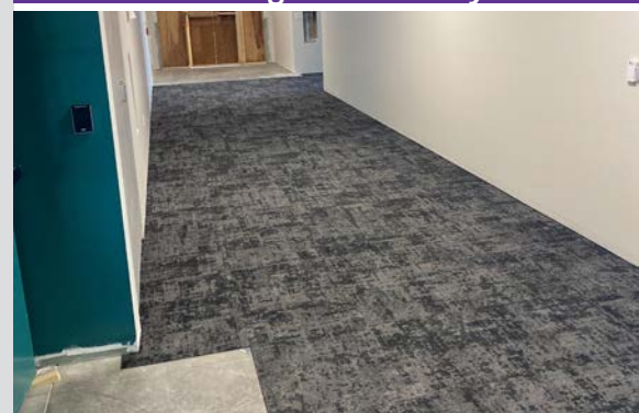
Carpeting - Early Childhood/Kindergarten Wing

Sunday, October 6 Ribbon Cutting at new Heritage Elementary School