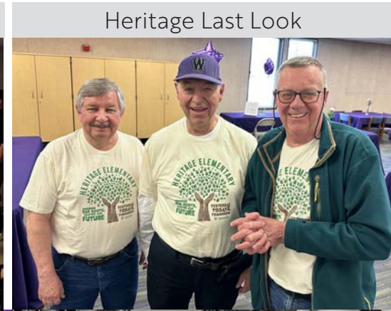
Heritage Last Look