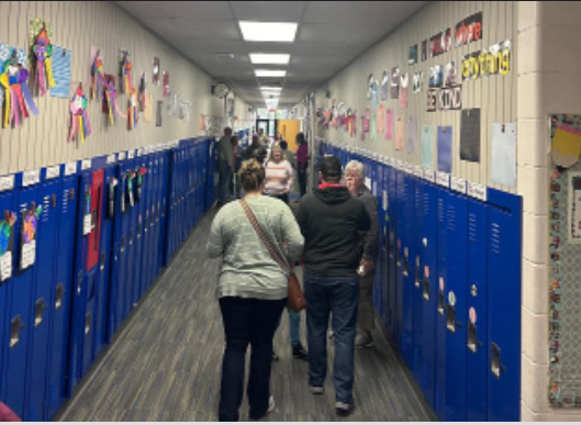
Heritage Last Look