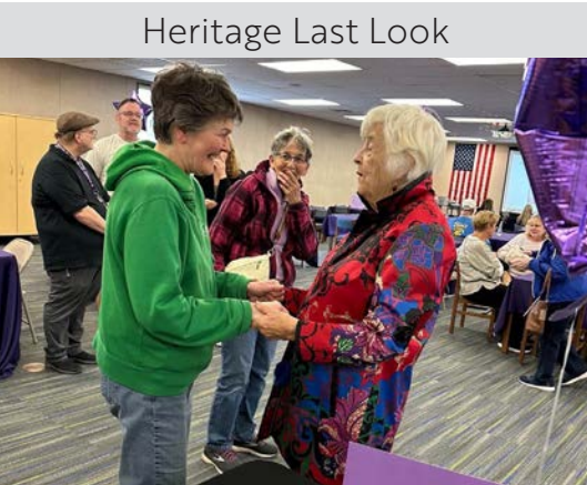
Heritage Last Look

Thank you to everyone who attended the Community Last Look Open House events at Heritage Elementary School. The Waunakee Community School District held a series of Community Last Look Open House events at Heritage Elementary in April 2024, including one on April 15 specifically for retired staff, and another on April 22 for students, staff, families, and community members.