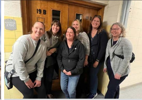
Heritage Last Look