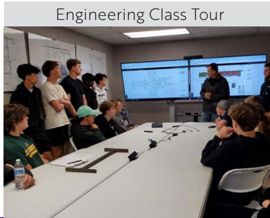
Engineering Class Tour