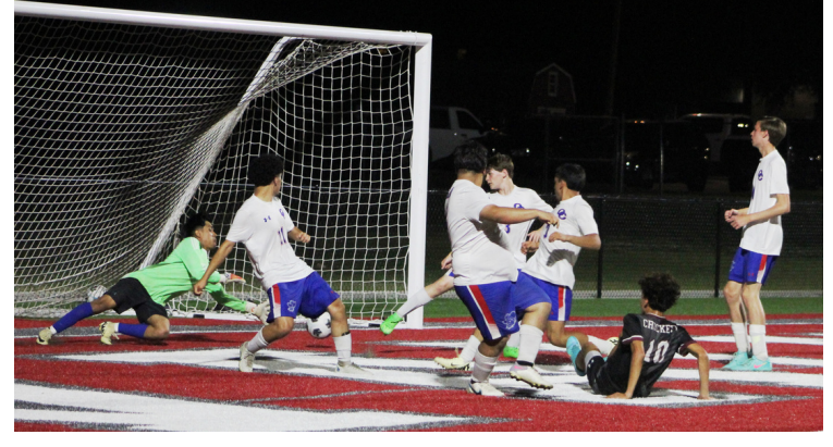
Above: ... and then capping off the magical play with a slide shot into the right corner of the net, past the helpless keeper for a hat trick.