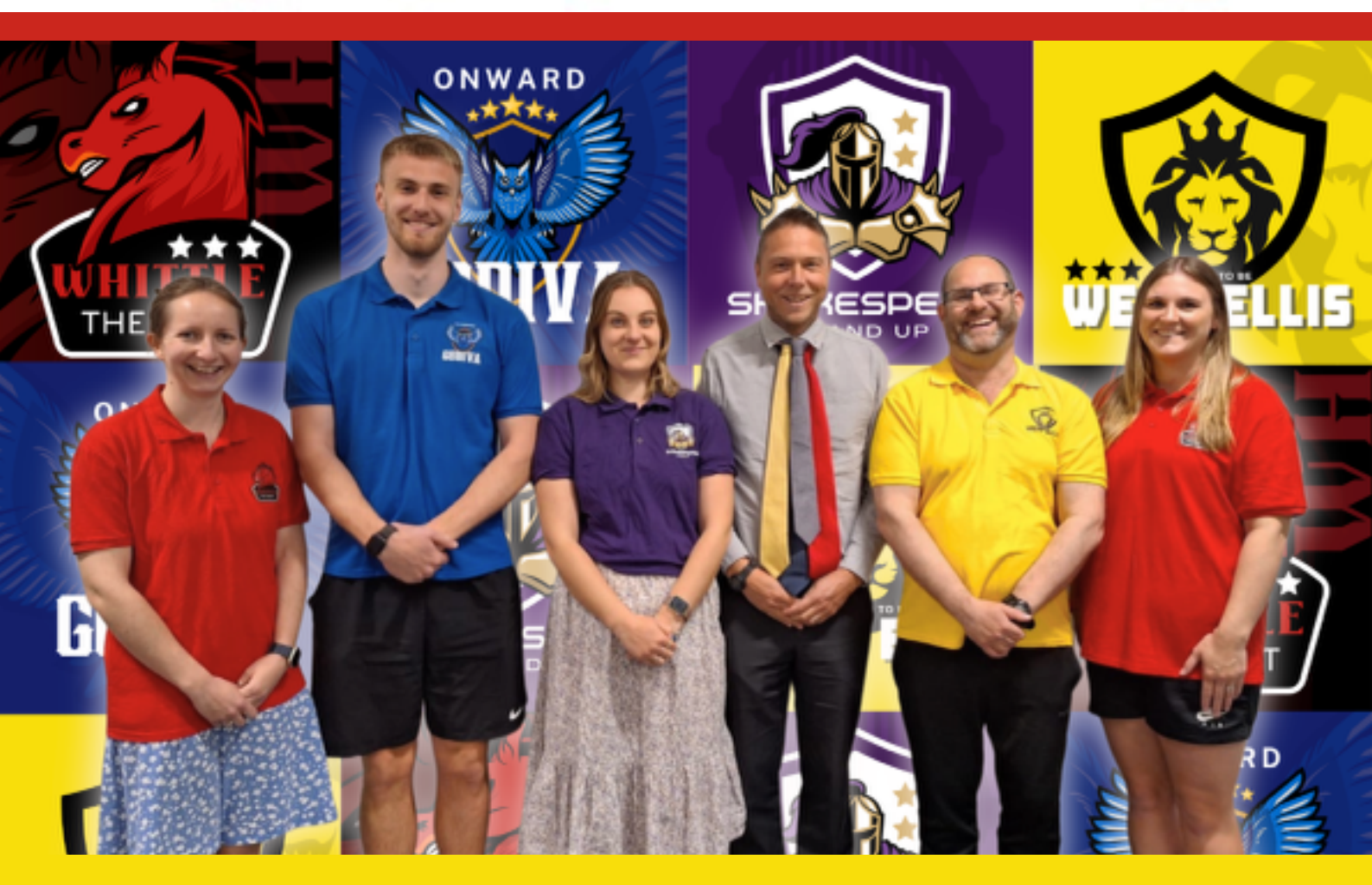
The top 3 in each house will progress onto the grand final at the end of the year.