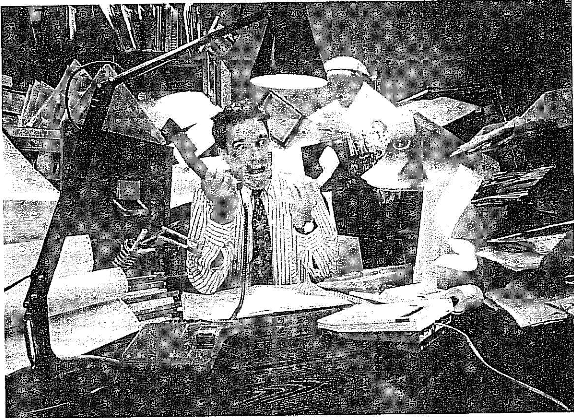
Faster! While Americans complain of job stress, only a fraction of the population is working harder. Most Americans have more leisure time than ever.

ties business—these developments and so many others have helped foster a vastly more competitive commercial environment than existed a generation ago, an era well within living memory for many American workers, who recall a time when U.S. industrial might was unchallenged.