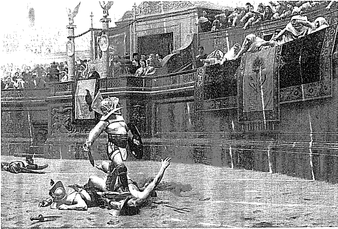
Is competition today more cutthroat than before? Ask the gladiators.

Nineteenth-century business practices were truly red in tooth and claw, while total output per person was so much lower in those days that merely staying alive was a competitive scramble for most people. Larger family sizes, meanwhile, meant more competition for parental attention, food, and inheritable resources.