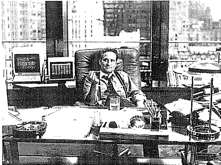
"Greed, for lack of a better word, is good," the fictional villain Gordon Gekko famously declared in Wall Street (1987). It's said that the film's depiction of brutal competition drew even more recruits to the real Wall Street.

So what's wrong with this? Plenty. Competition skews the balance, and threatens real democracy. More fundamentally, it fails to comprehend freedom's true character. In the human balance, given that we are creatures of nature and artifice, of both rivalry and love, we normally live in parallel, mutually intersecting worlds of competition and cooperation, if not quite as grimly or definitively as Ruskin imagined. Competition may not be the law of death, but as the law of the marketplace and the radically individualistic people who populate it, it distorts and unhinges our common lives and slights the necessary role of cooperation and community in securing liberty. In construing ourselves exclusively as economic beings—what the old philosophers used to call homo economicus —we account for ourselves as producers and consumers but not as neighbors and citizens. We shortchange real liberty.