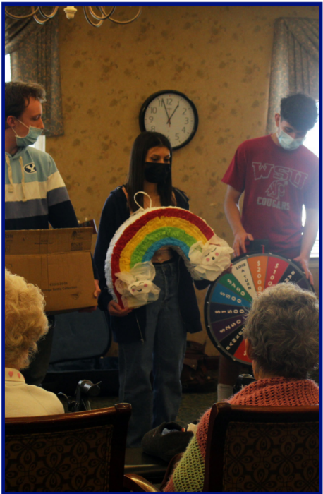
Top: Students present the project to residents

Cheney High CTE programs look forward to partnering with the Assisted Living Center for future volunteer projects. Thank you, CTE students!