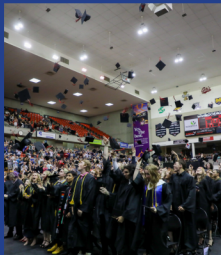
On the Cover: Cheney High School Graduates throw caps into the air at the end of commencement