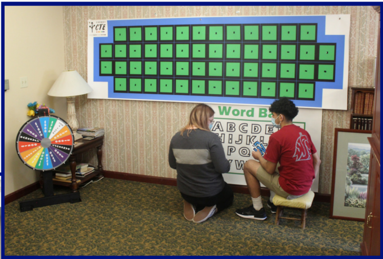
Bottom: Students installing the Wheel of Fortune game in a sitting room of the Cheney Assisted Living Center