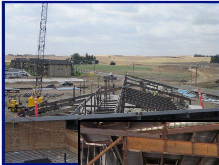
Buildings under construction

Thank you for your support of our schools, and we look forward to many more decades of use out of these two great schools.