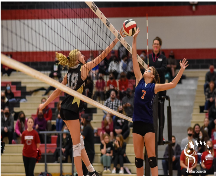
CMS v. WMS 8th Grade Volleyball