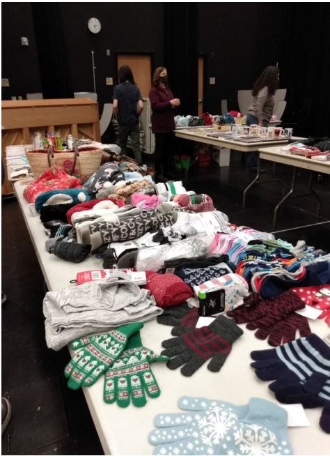
Westwood's Holiday Store