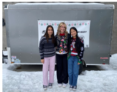
Above: Presents collected in trailer ready for distribution