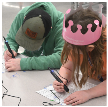
Cheney CTE Attendees at the STEM Night cond Annual one of the many activities available.