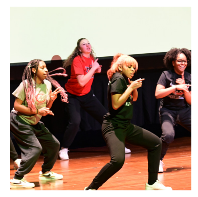
CHS's Black Student Union performs at the third-annual Spokane Black Voices Symposium, presented by The Spokesman-Review.