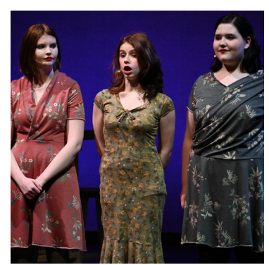
Members of CHS Drama perform in These Shining Lives in early February.