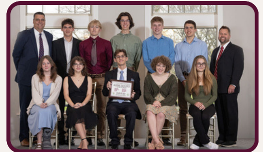
Westosha Central's 2024 Southern Lakes Academic Top 10