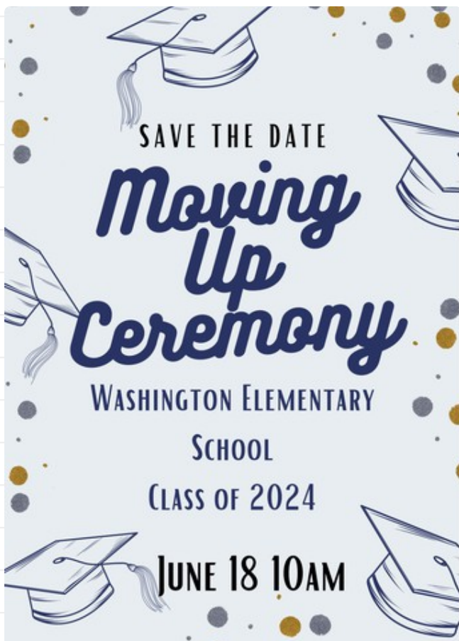
5th Grade Moving Up Ceremony