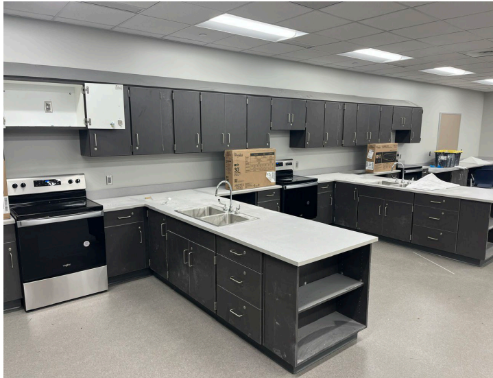
Stoves Installed in Food Service Room