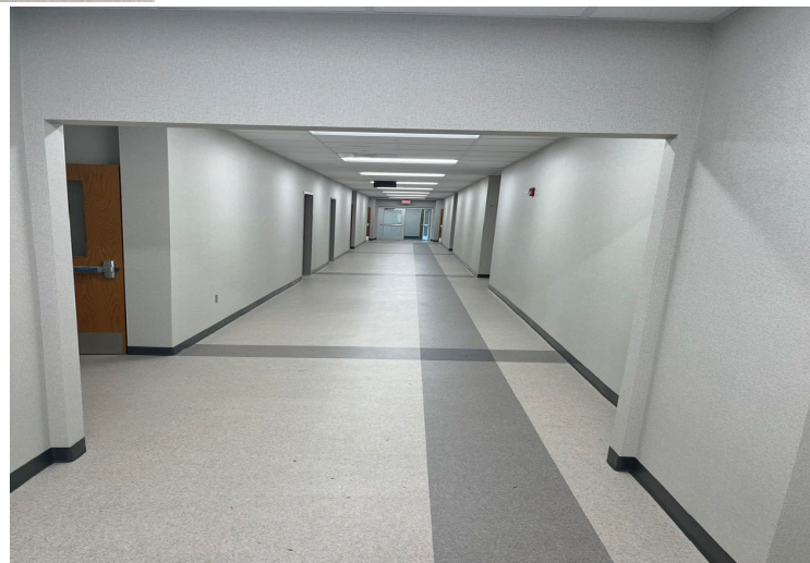
Completed Hallway in Unit H