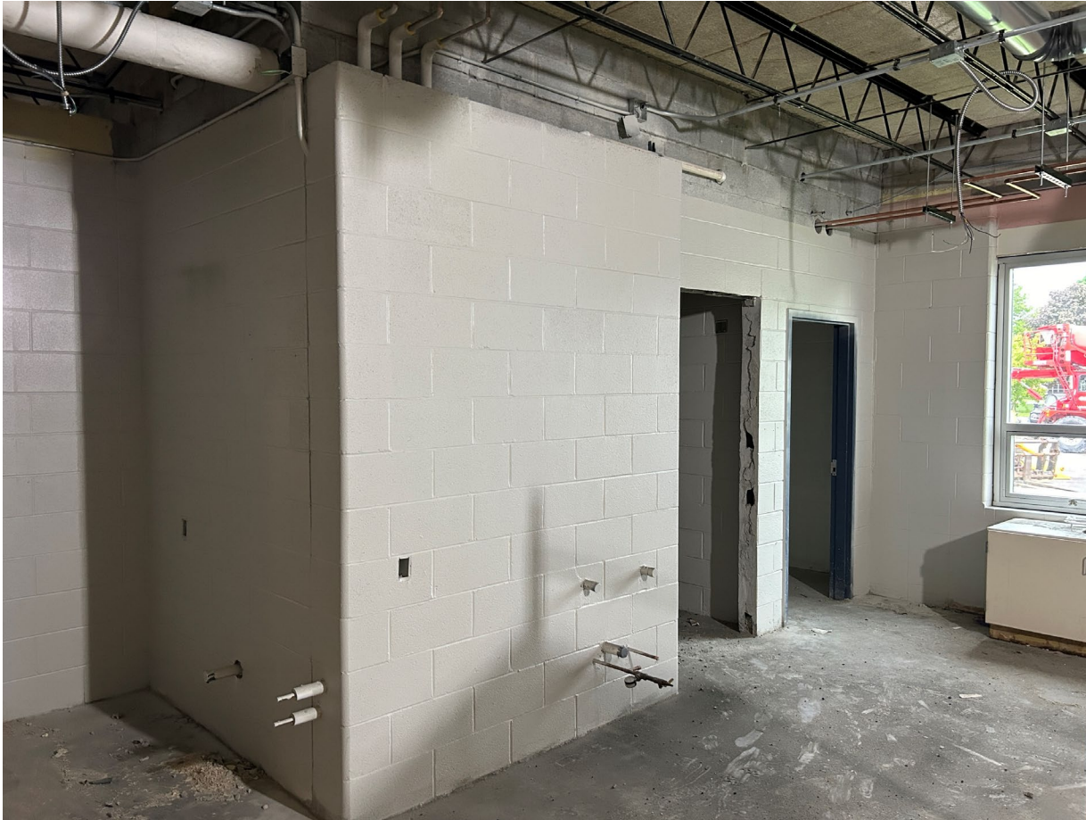
Kindergarten Restroom Progress