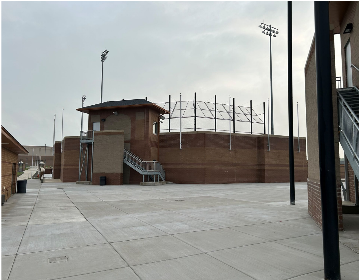
Varsity Baseball Grandstand Progress