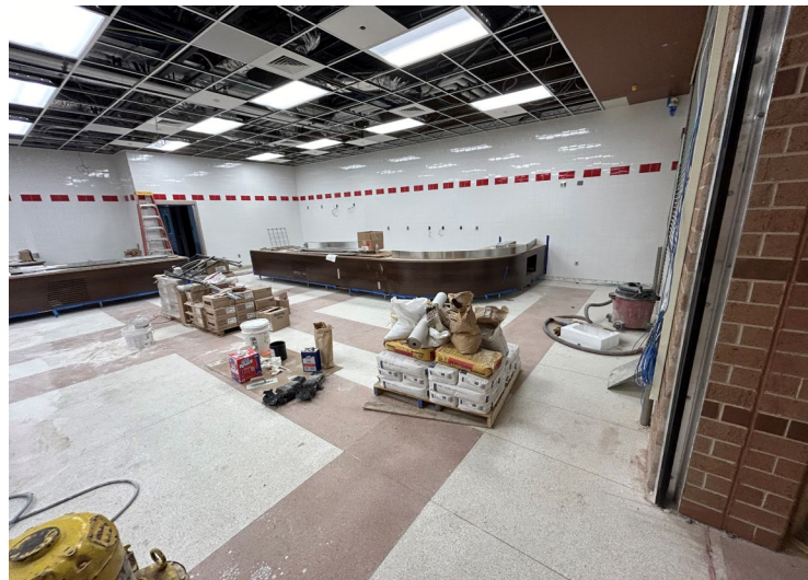
Unit M Progress