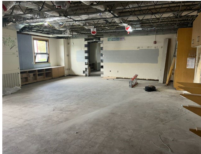
Unit C Classroom Demo