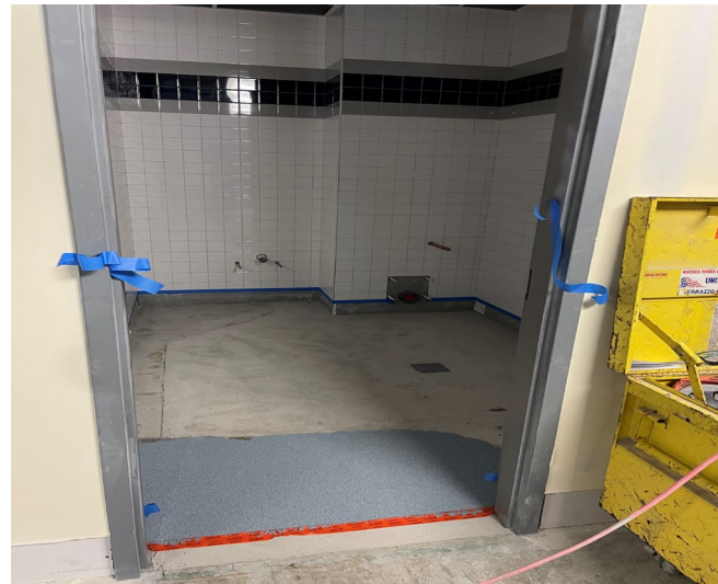
Completed Wall Tile in Classroom Bathroom