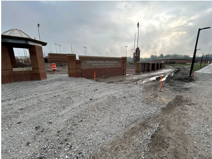
Athletic Field Signage