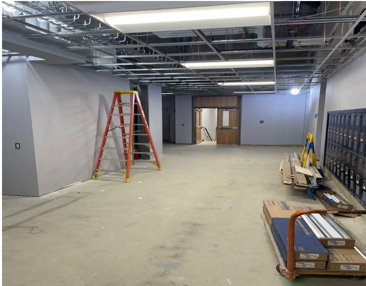
Unit B Ceiling Progress