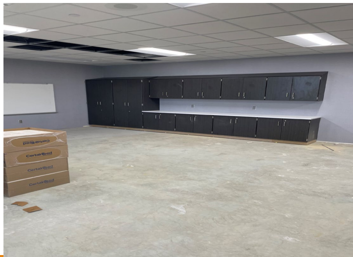
Unit B Casework