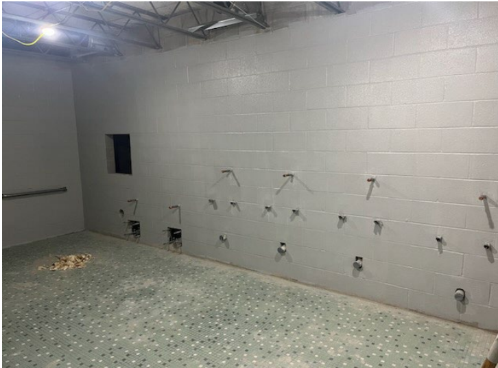
Unit C Restroom Progress