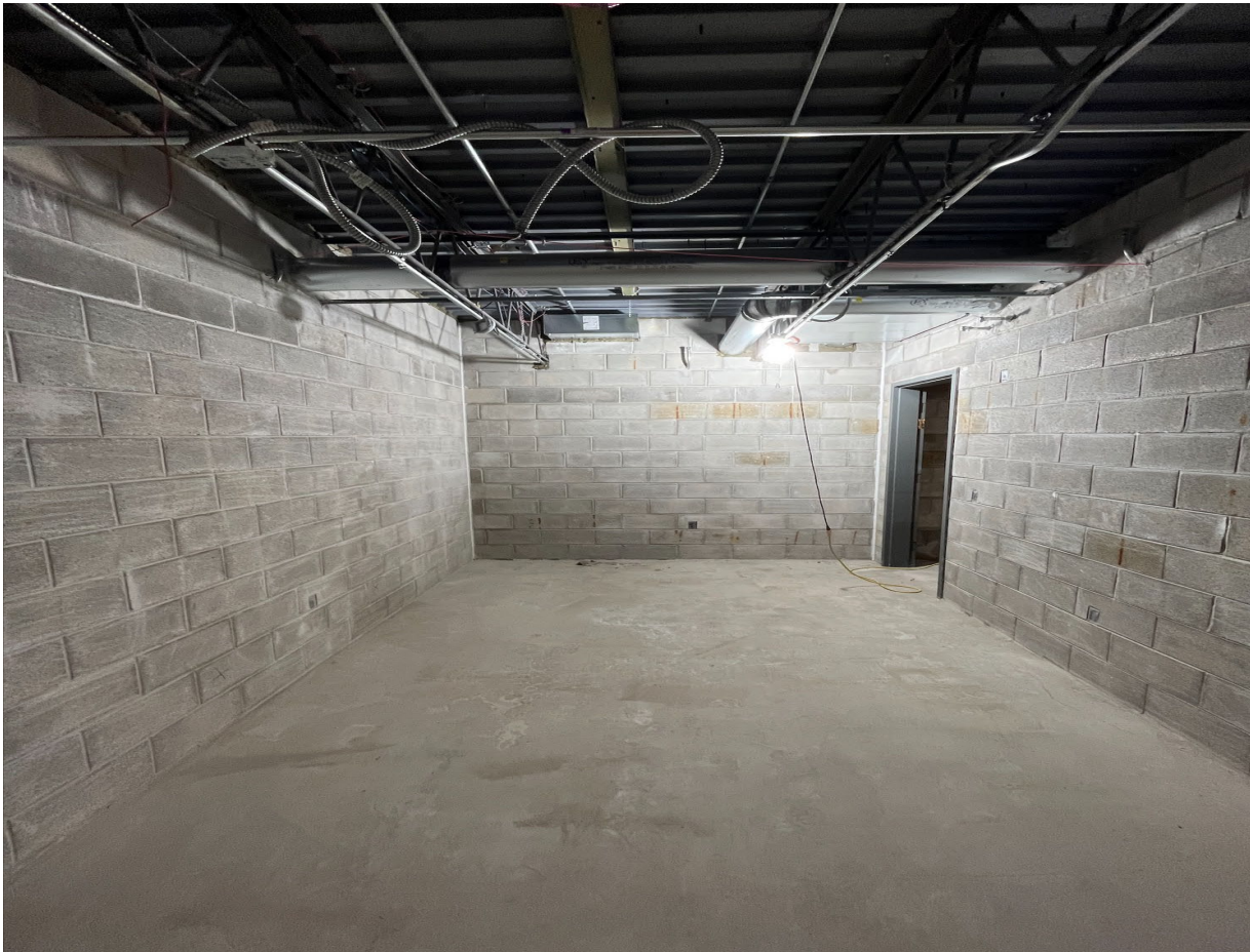
New SGI Room Progress