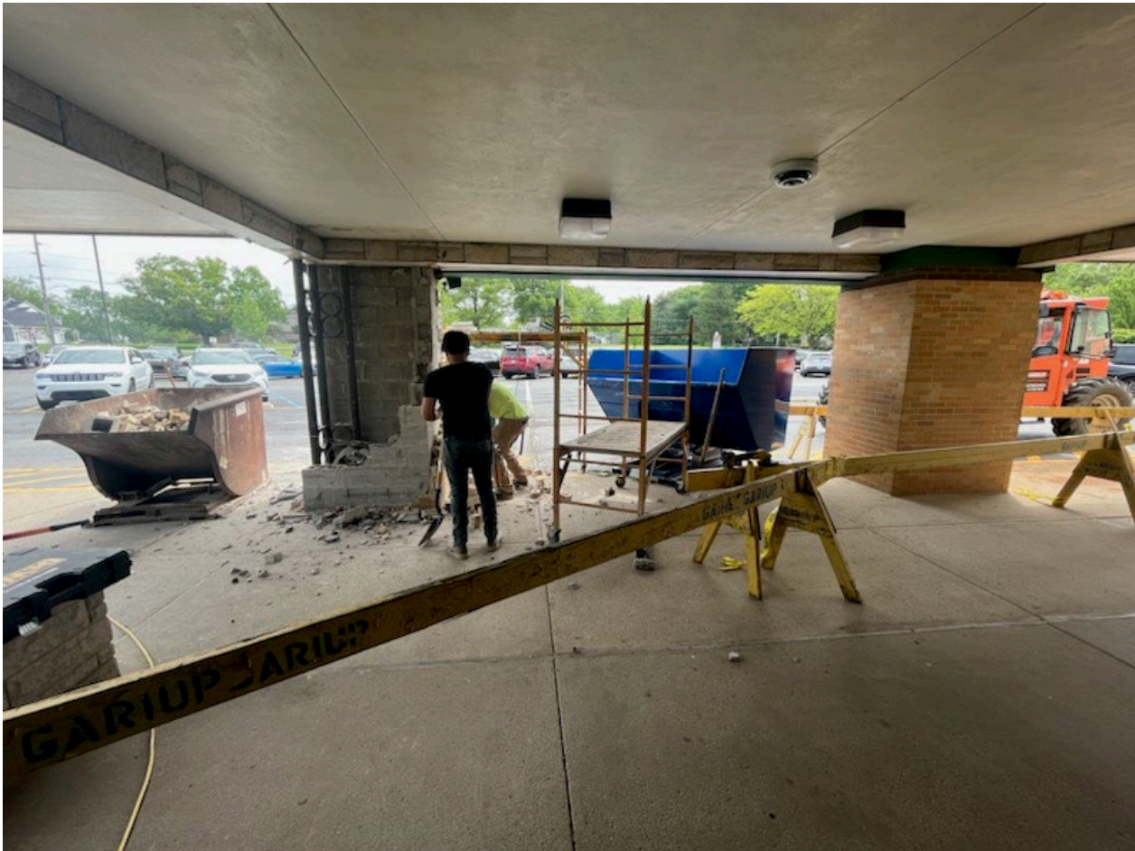
Exterior Column Removal Progress