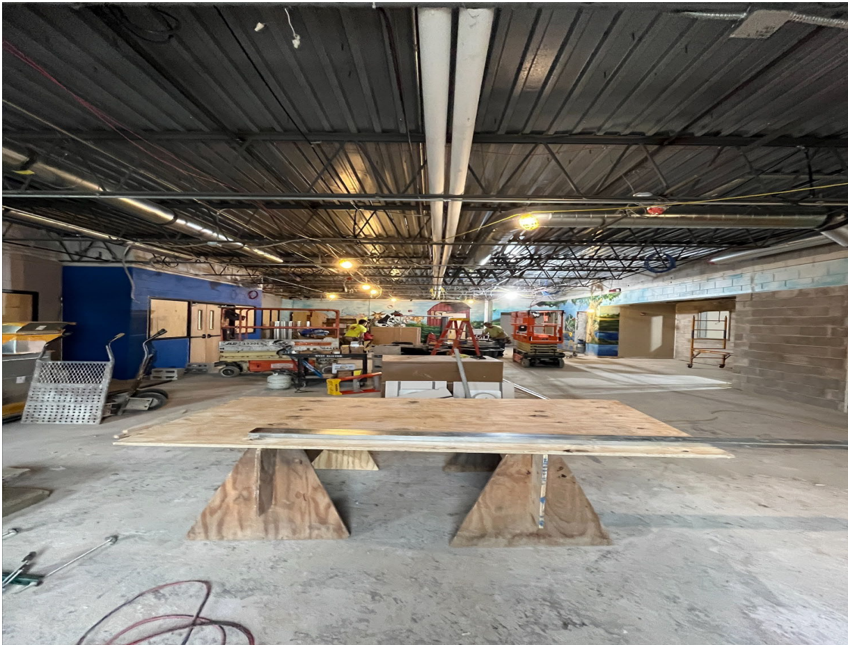
New Media Center Progress