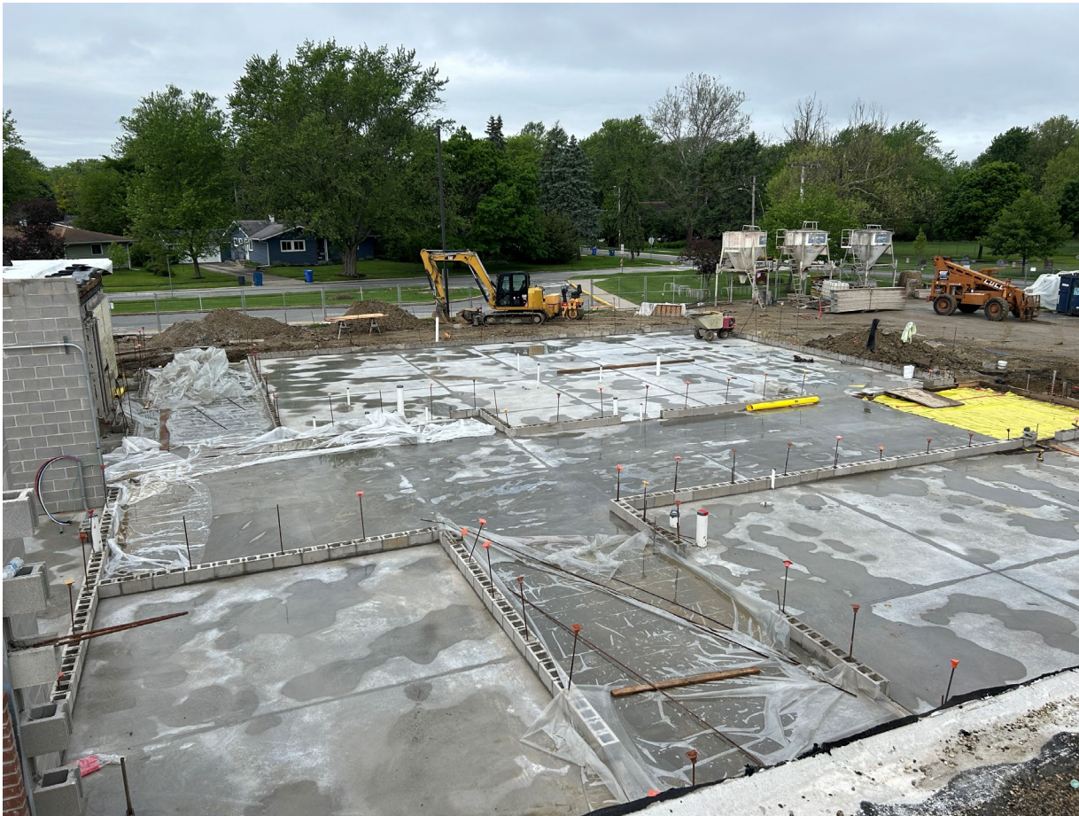
Unit A Addition Progress