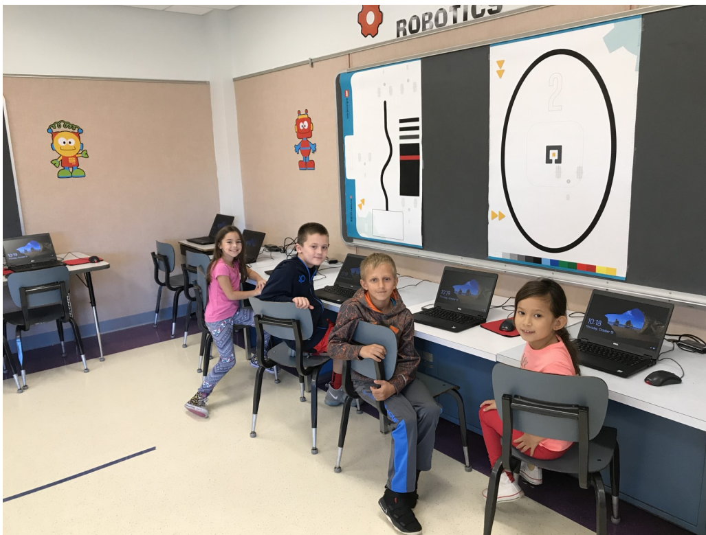
Students showing off the new laptops in the laptop lab!