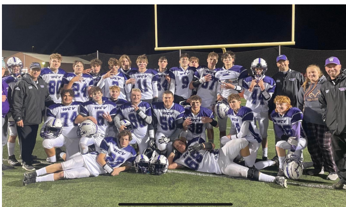
BOYS VARSITY FOOTBALL 2022 LEAGUE CHAMPS 8 MAN FOOTBALL