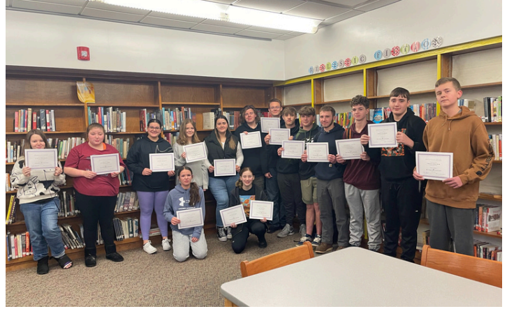
JANUARY 2024 STUDENT RECOGNITION AWARDS