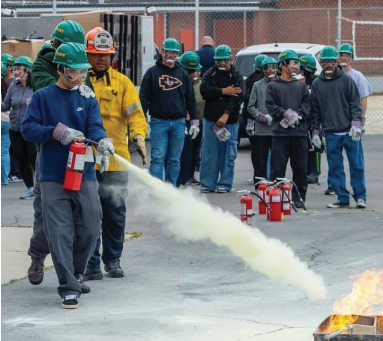
Los Angeles County Fire Department support La Puente High School students as they extinguish a fire during the in-person portion of their hybrid CERT training on April 13.