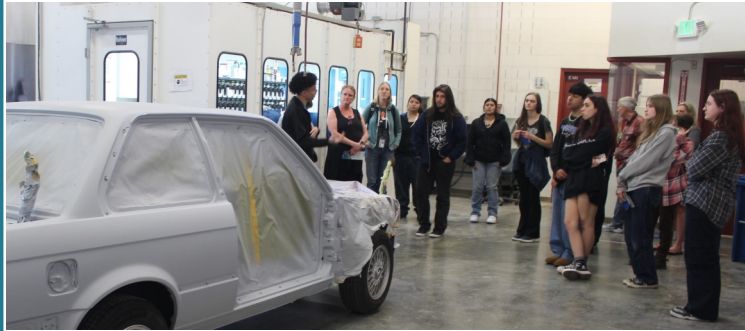
Auto Body Workshop