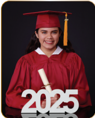
Available in Black, White, Blue, Red, Burgundy, Brown, and Green.