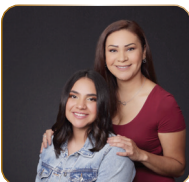
Pose with mom, dad, grandparents or siblings. Three people maximum including senior.