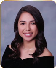
Sample of our tuxedo. Sample of our drape.