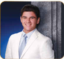
Choice of 3/4 length or color key background to complement your clothing.