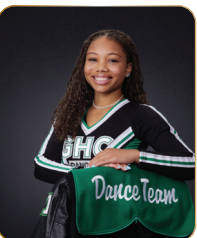
An opportunity to be photographed with your sports uniform, musical instrument, or a prop you provide.