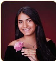
Taken in fur or drape for the ladies. You may accent with a necklace or earrings you provide.