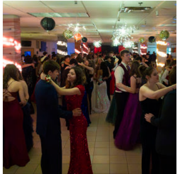
WINTER CARNIVAL 2024 PROMO VIDEO