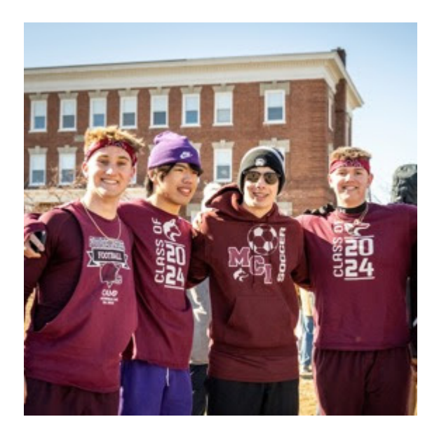
WINTER CARNIVAL 2024 GALLERY

Winter Carnival 2024 was definitely one for the record books! While the weather didn't necessarily cooperate for a winter wonderland, there were still plenty of fun and festivities had by our entire MCI community. Between the volleyball, "sledding" relays, bombardment, Quiz Bowl, cornhole, skits, kickball, tug of war, basketball, and annual Sno Ball, Winter Carnival is always one of the greatest times of year on our campus and this year was no different. To view our full album of Winter Carnival photos and a video capturing the events, please click the links below!