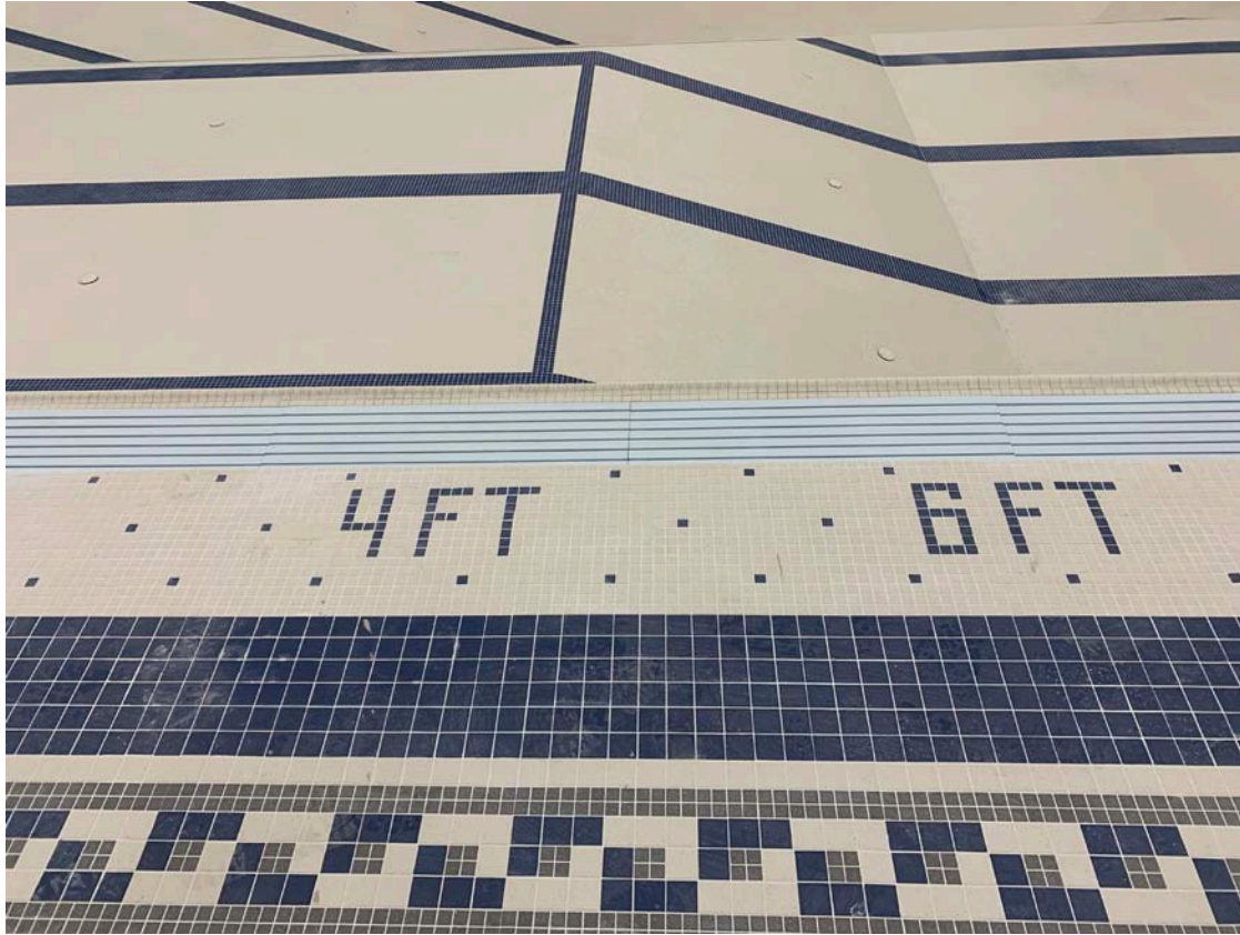
New pool deck tile has been installed and grouted.