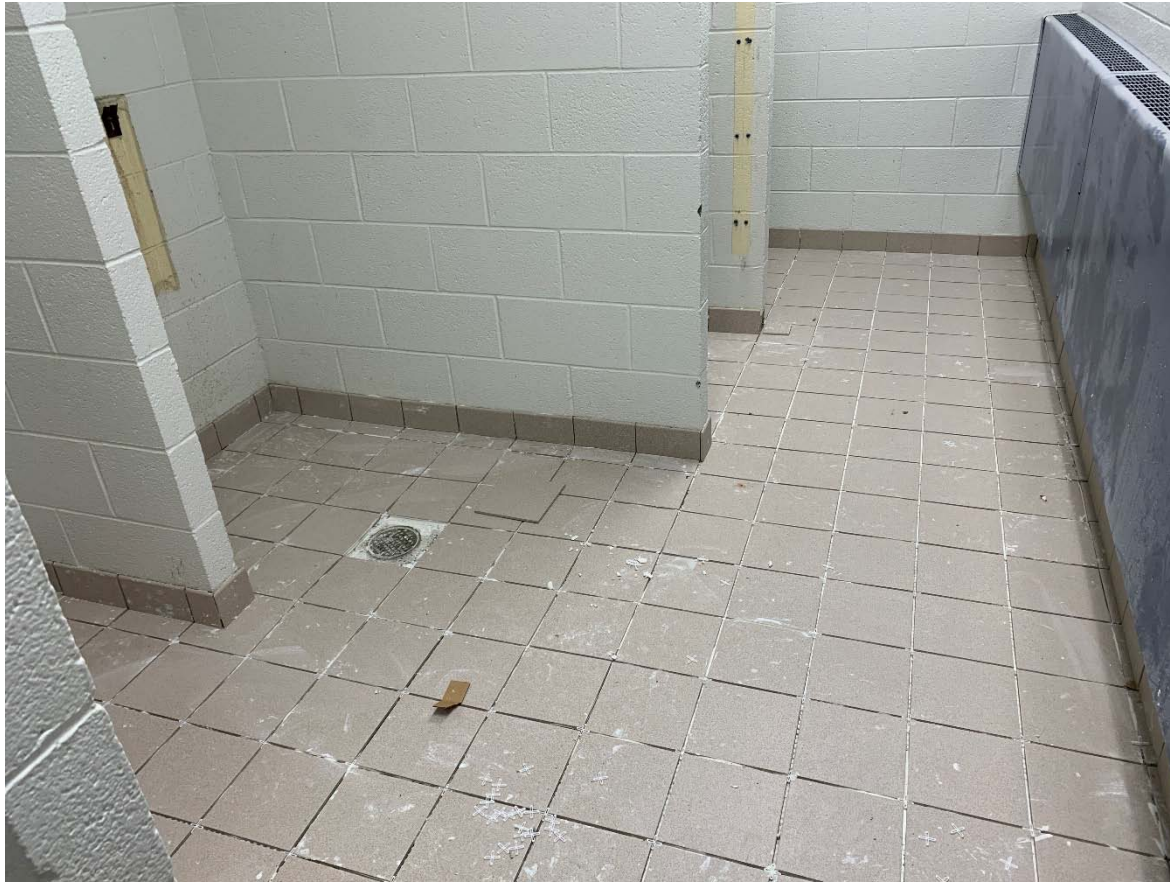
Various bathrooms new tile installation has begun