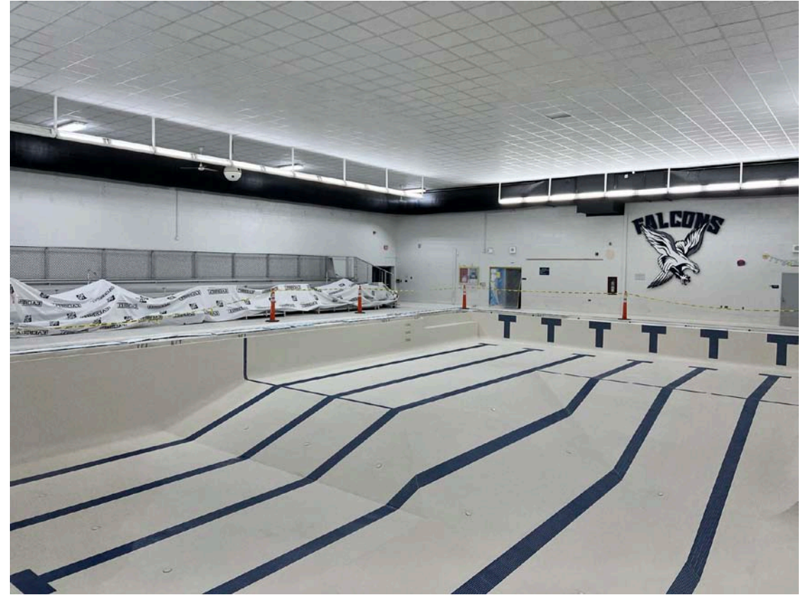
Pool base and walls have been acid washed to prep various areas for new grout.