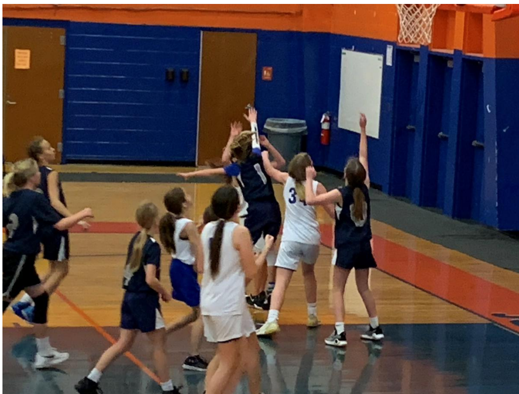
6 th grade girls in action on Saturday, January 15, 2022 against Cario Middle School