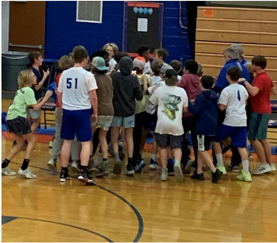
The crowd celebrating after the 6 th grade boys' championship win.