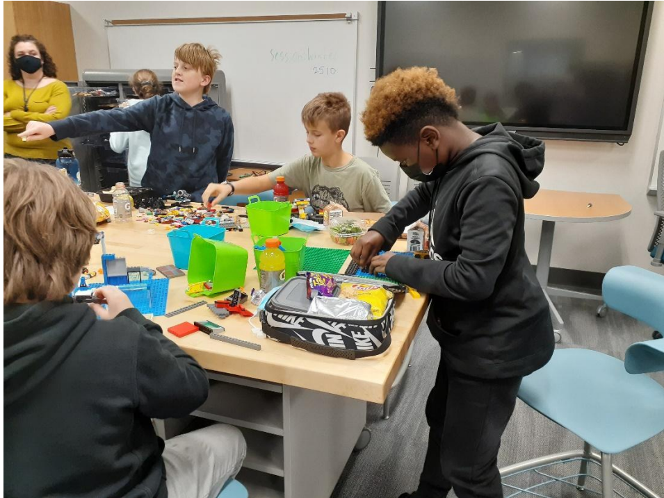
6 th graders at Lego lunch on Monday