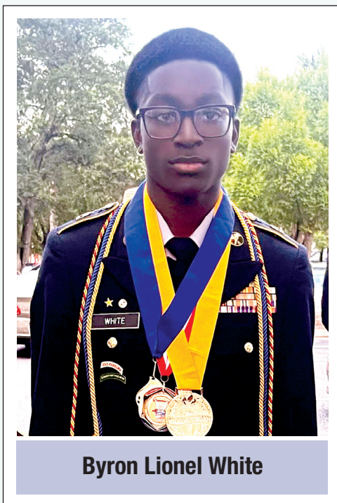
Byron Lionel White