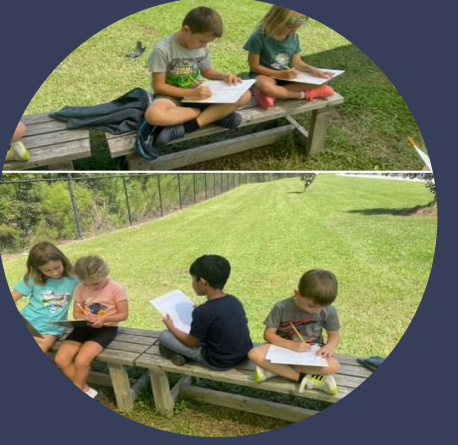
One of many opportunities for students to utilize our outdoor classroom

Our School Improvement Council stays active with parents and families. During the 2022-2023 and 2023-2024 school year we sponsored: