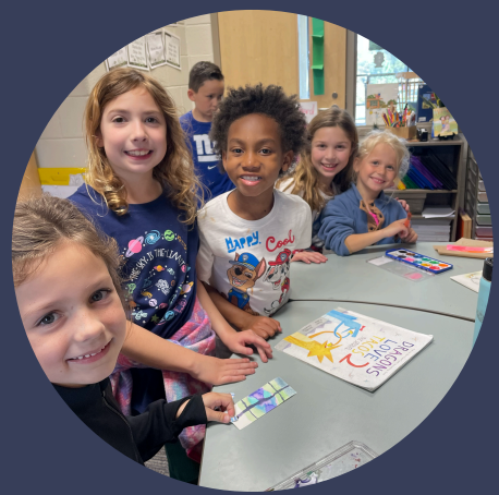
Book buddies: first and third graders become friends over a shared experience

Our academic data is a result of the dedication of our incredible faculty and students. We are proud to share that we achieved our highest percentages of Meets/Exceeds Expectations on SC Ready ELA and Math assessments in school history. Grade-level teams meet monthly with the instructional leadership team to analyze student data and create action steps within our curriculum to meet students where they are and elevate their learning to the highest potential. ESSER funds provided opportunities to extend our intervention services, guidance support, and Kindergarten orientation camp. In Spring 2023, we launched our "SC Ready, Set, Go!" program, an after-school tutoring opportunity to prepare students for the SC Ready assessments. Carolina Park Elementary prides itself on high academic achievement while maintaining a culture focused on the arts and fun!