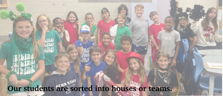
Our students are sorted into houses or teams. Each house earns points through positive behaviors, leadership skills, and community service projects. We are 4 Houses, 1 Pack!