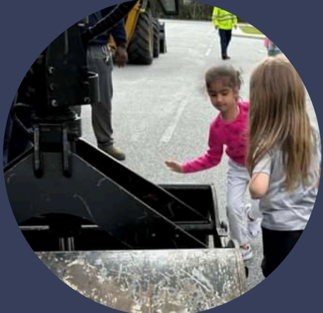
The Guidance Department provides Touch A Truck for grades K-2