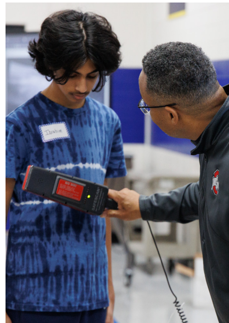
The Ohio State University Wexner Medical Radiology staff demonstrate medical imaging technology to middle school students.

Olentangy: BridgED was formed through an inaugural partnership between BridgED, the Educational Service Center of Central Ohio (ESCCO) and Olentangy Schools.