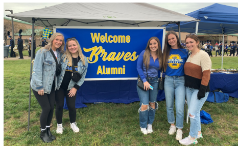
Alumni Gathering at Olentangy High School on September 23rd.

This was the first year of this annual event, and each high school will continue to partner with the Olentangy Schools Alumni Association to welcome alumni back each year. This winter, dates and information will be announced for the 2023 alumni gatherings.