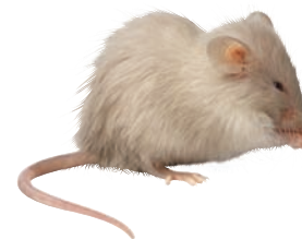
Baby mice raised in captivity without their mother may be fed milk or formula.