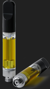
Cartridge AKA cart