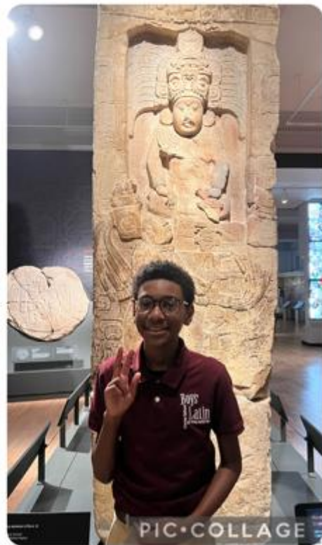
Teacher Appreciation Week