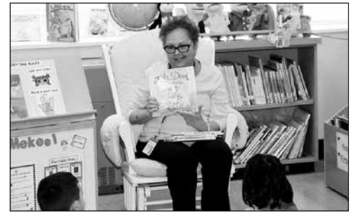
Kindergarten and pre-K students at the Parkville School Early Childhood Center love to read!