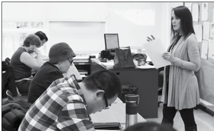
The Adult Learning Center on Clover Drive provides a variety of educational opportunities for adults to improve basic skills, earn a high school equivalency diploma, prepare for college, or learn English as a Second Language.