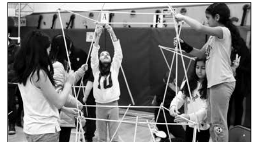
Saddle Rock School students participate in an engineering challenge during the school’s STEM Night.