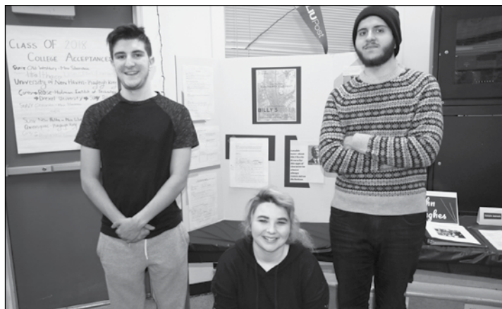
Village School students present projects during the annual Village School Exhibition event.

The 2018–19 proposed budget may be viewed on the District website at www.greatneck.k12.ny.us. Printed copies of the budget are available at the Phipps Administration Building, 345 Lakeville Road. Reference copies can be found in the schools and libraries. For details about the budget, voter registration, absentee ballots, and voting, please call (516) 441-4020.