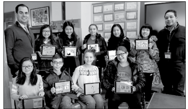
South Middle students authored and illustrated fictional children's stories based on factual animal research they conducted in science class. The digital books were presented to elementary students throughout the District.