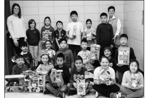
E.M. Baker School students show projects they created about their heritage to celebrate International Week.