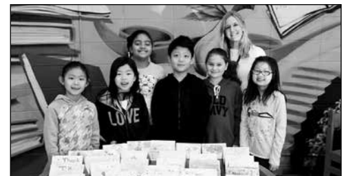
Lakeville School students create greeting cards for residents in local nursing homes.