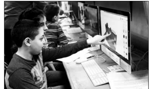
Kennedy School students use Tinkercad software to create designs that come to life using 3D printers.