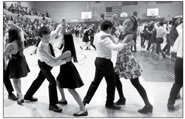
North Middle students showcase ballroom dancing skills they learned through the Dancing Classrooms program, now in its seventh year in the Great Neck Public Schools.