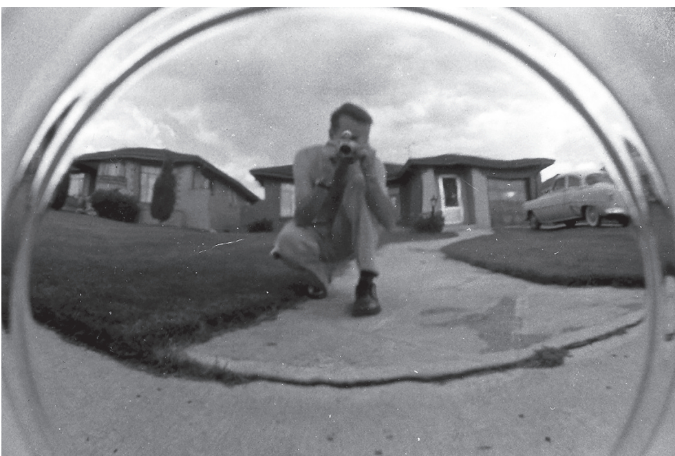
in front of the family home on Hudson Street in Denver, c. 1955.