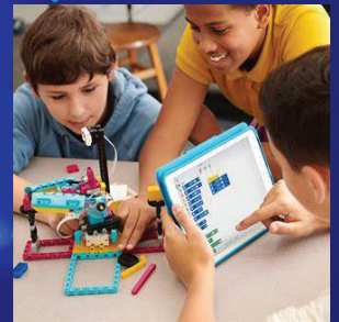
Advanced LEGO with Spike

Please go to our website for prices and options. GreaterMilwaukee.ClubSciKidz.com