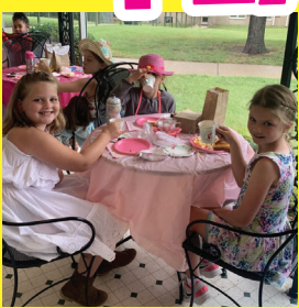
American Doll: Grades 1st-5th