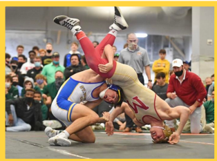
July 15-19 - Wrestling