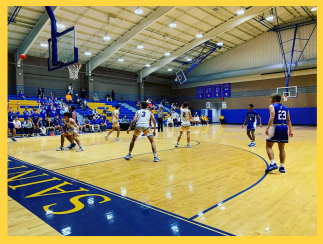
June 3-7: Basketball