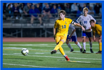
June 24-28: Soccer