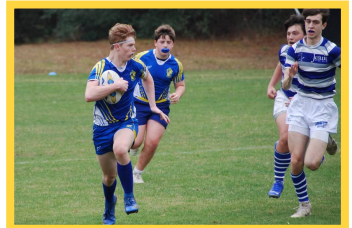
July 15-19 - Rugby