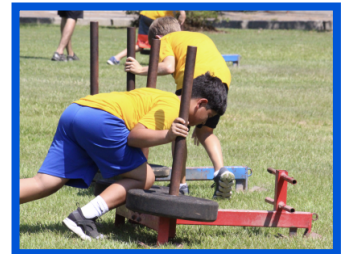
July 8-12: S,A,S Speed, Agility, and Strength