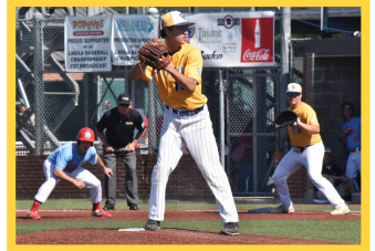
June 17-21: Baseball