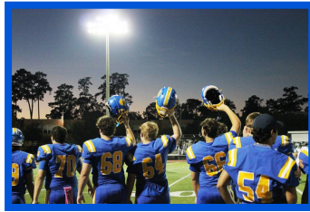
June 10-14: Football