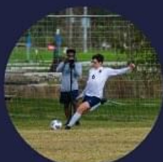
Soccer Ball Striking