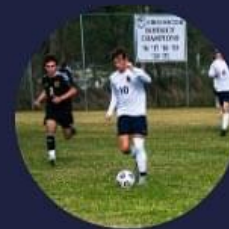
Attacking Skills Soccer Camp