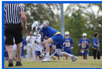
July 15-19 - Lacrosse