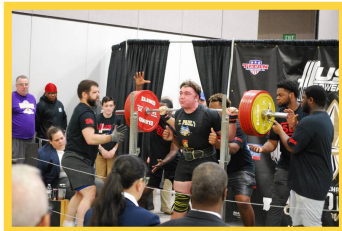
June 24-28: Strength