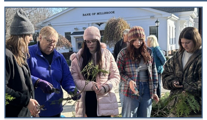
Students from the Stissing Mountain Horticulture class and the Pine Plains Garden Club teamed up for Pine Plains Town Decorating Day.