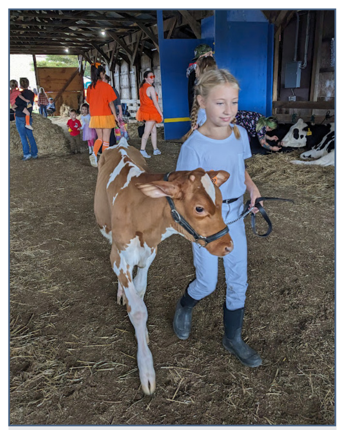
Annual Ag Day tradition - Each year students from Seymour Smith ILC are invited to visit one of the local farms after school where they learn how to care for one of the animals. Students then "show" their farm animal at Ag Day. It is a unique and memorable experience for our elementary students.