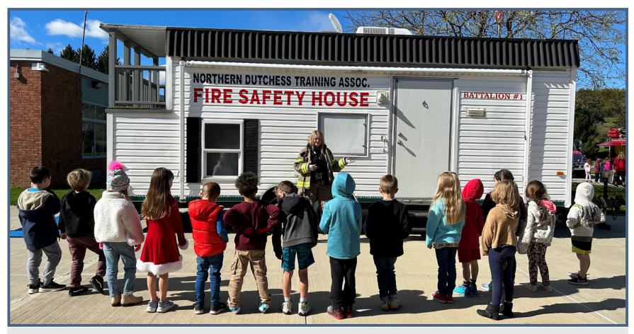
Our youngest learners at Cold Spring ELC participated in Fire Safety Awareness Day with help from the Stanford Fire House and surrounding fire companies.