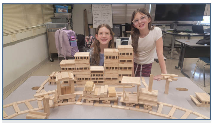
The Middle School Media Club challenged their minds through reverse engineer building with Keva Planks.

www.ppcsd.org Budget Newsletter 2024-2025