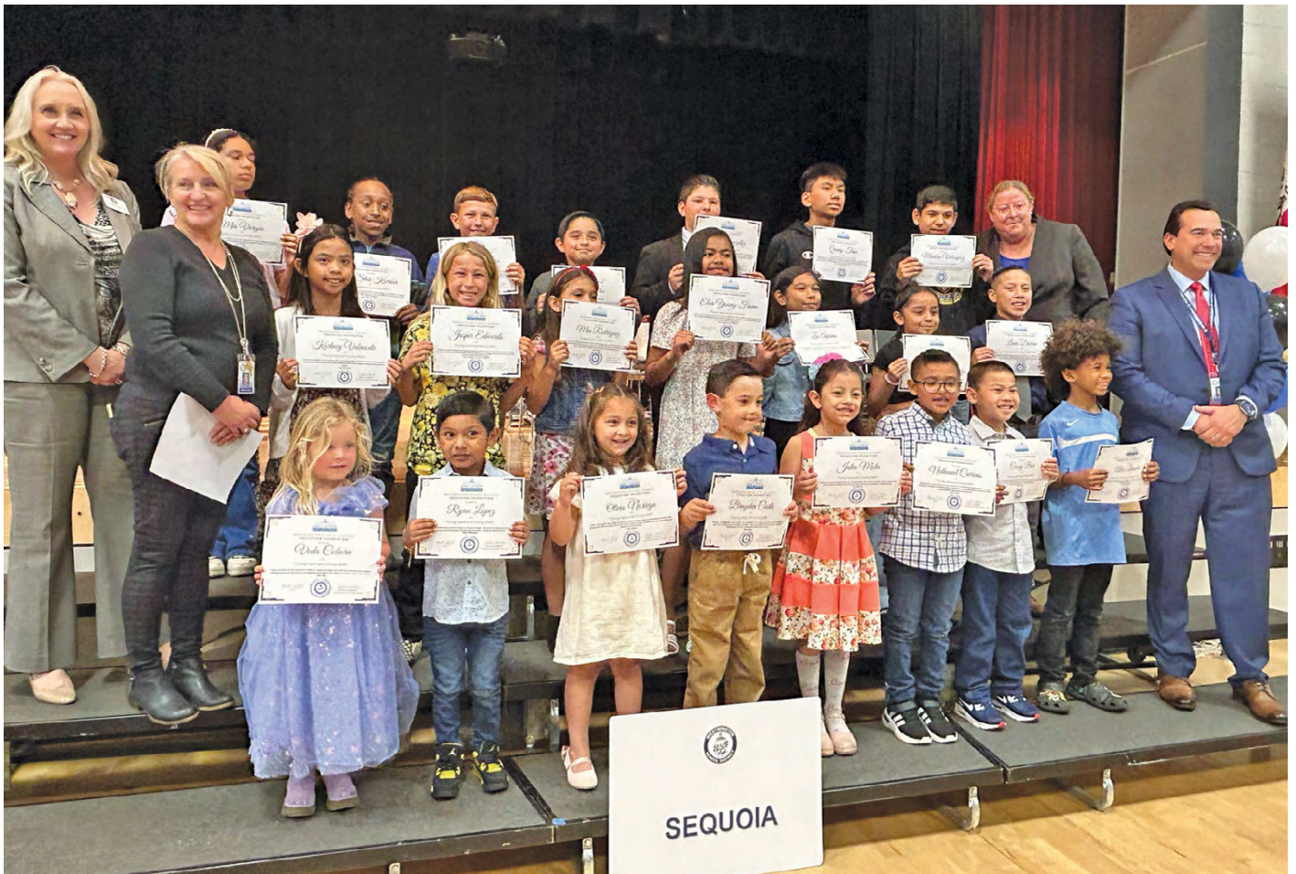
The Annual Foundation Awards bring students, staff, and families together to recognize our incredible scholars.

As we look ahead to the remainder of the school year, I am excited for the upcoming events, celebrations, and ongoing community collaborations we cultivate. Let's continue to aspire to inspire our students and the WSD community.