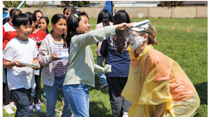
Principal Pie in the Face

At Hayden, each day presents new opportunities for learning, laughter, and unforgettable experiences. Our school will continue to prioritize community engagement and remain dedicated to providing enriching experiences that inspire, uplift, and unite our diverse community.