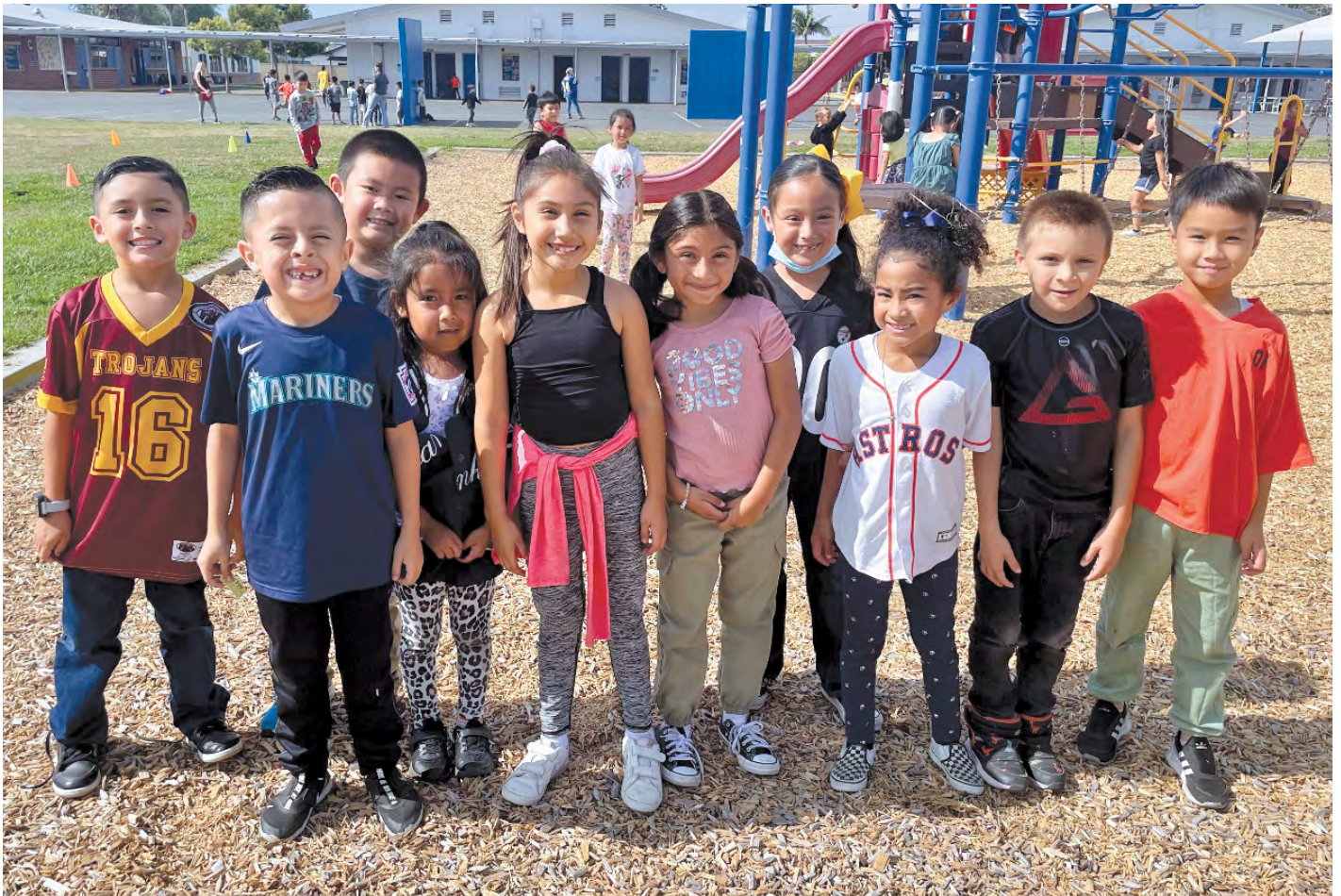
Lions are Leaders

We're excited to embark on this journey together with our students, parents, and staff. Together, we'll create a school environment where every child has the opportunity to thrive and reach their full potential. We will embrace the 7 Habits and inspire greatness in every student at Schmitt Elementary!