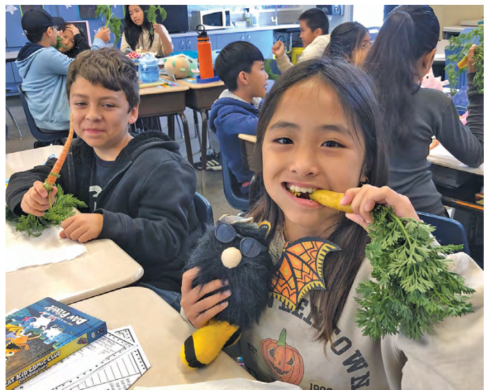
Fourth graders trying rainbow carrots from Harvest of the Month