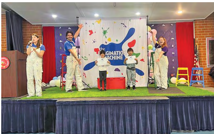
Imagination Machine Assembly