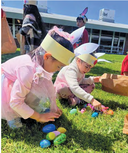
Spring Egg Hunt

At the Imagination Machine assembly, our scholars were delighted to see their very own stories come to life as acted out by a performance troupe. Another exciting highlight of the school year was the Bubble Run, which proved to be a tremendous success. The students smiled from ear-to-ear as they gleefully dashed through the obstacles of bubbles alongside their friends. But perhaps the most unforgettable moment of the day came when students had the opportunity to pie the principal in the face and playfully silly string her!