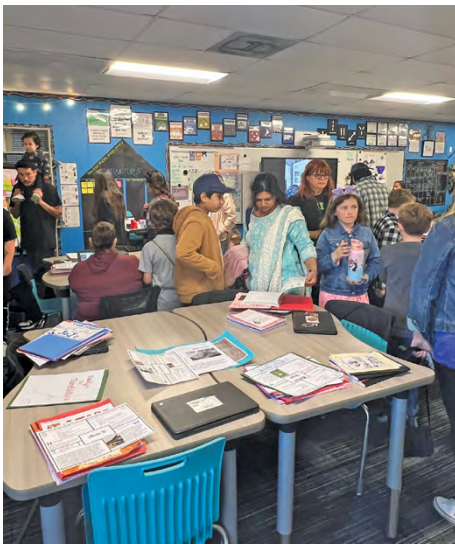
Eagle families explored classrooms.