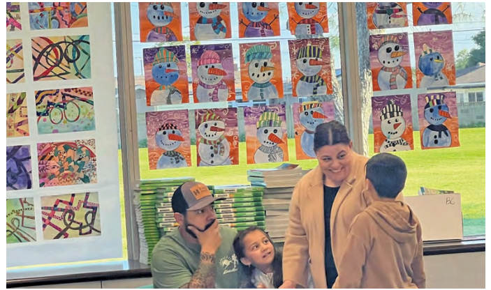
Eagle families learned about their students hard work.

This event also emphasized the vital role of family involvement in the educational process, with parents and guardians engaging in discussions