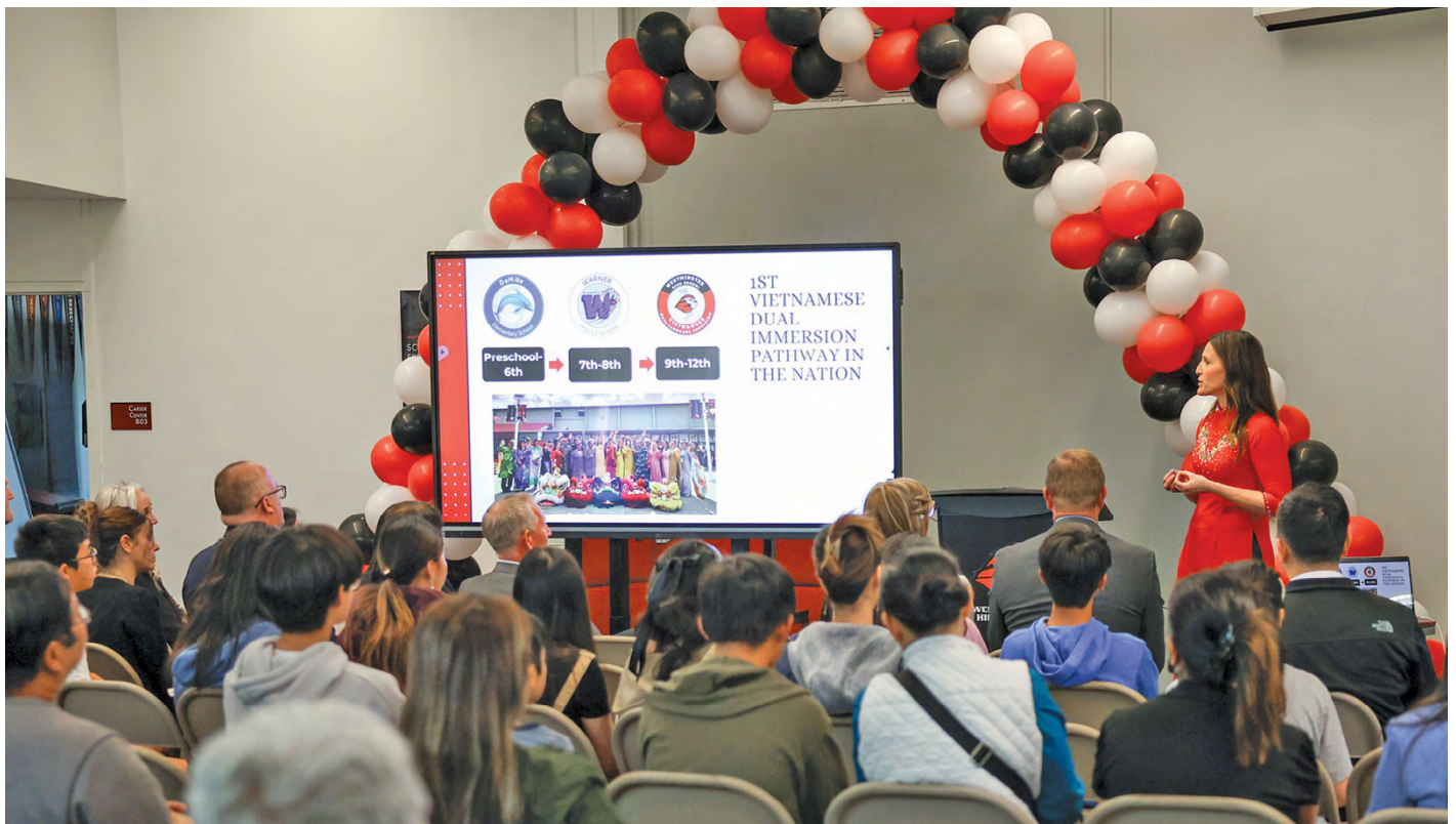
WHS gives staff, students, and families the rundown of the VDLI program during the Lion Showcase.

WSD was the first in the state to start a VDLI program back in 2015 and once again our district is the first to pioneer a program that reaches new heights for our students, families, and staff. It's an incredible process to be a part of and we are thrilled to provide this opportunity to our academic community.