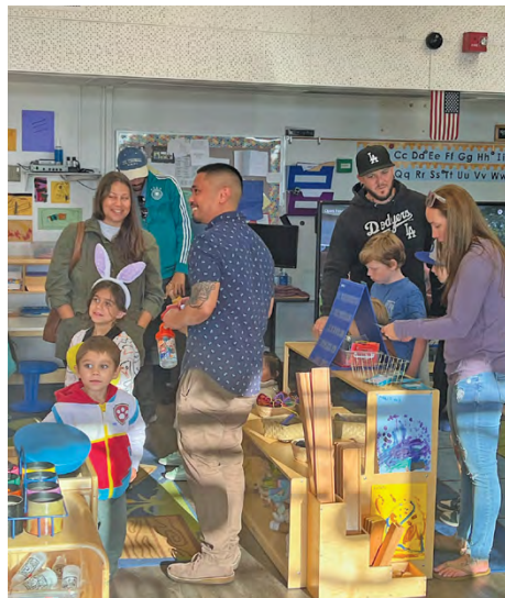
Preschool Eagles showed off their classroom.