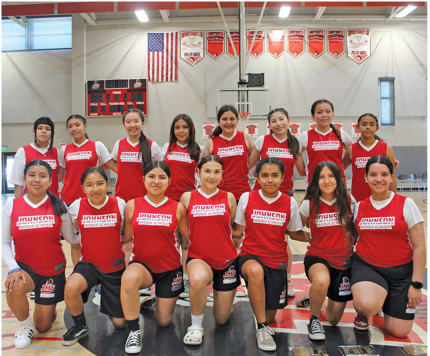
Members of the 2024 Johnson Girls Basketball Team

As the school year ends, the memories and lessons learned from sports seasons will continue to resonate with students. Many will go on to compete in High School sports, but even if they don't they will remember the competition and excitement they had as a Johnson athlete.