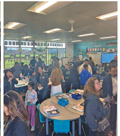
Eagle classrooms were packed with community members.