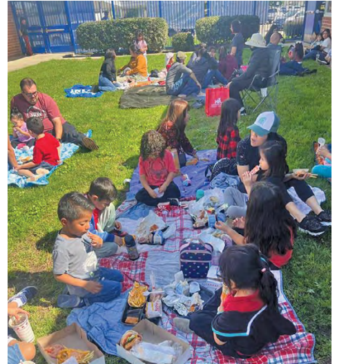
Lunch on the Lawn

At Hayden, each day presents new opportunities for learning, laughter, and unforgettable experiences. Our school will continue to prioritize community engagement and remain dedicated to providing enriching experiences that inspire, uplift, and unite our diverse community.