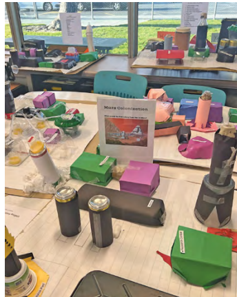
Eagle students displayed their learning through projects.

Sequoia Academy looks forward to building upon the success of this year's Open House and Showcase. We will continue to both inspire excellence and foster a lifelong love of learning among our Eagle students, families, and community.