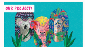
ANIMAL WALL HANGING