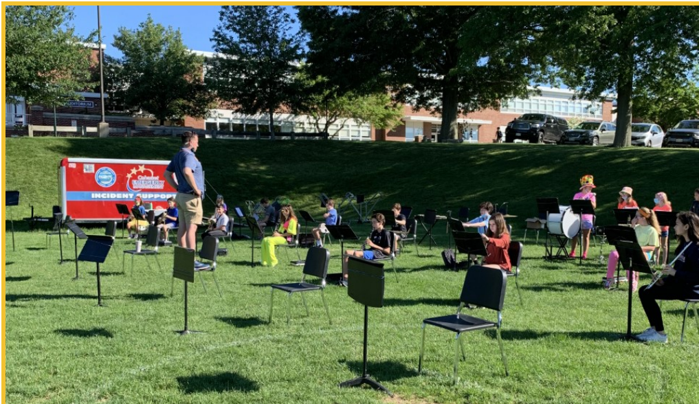
Band students play for students & staff